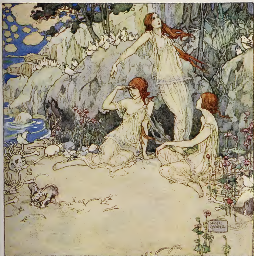
THE SIRENS OF ANTHEMOVSA