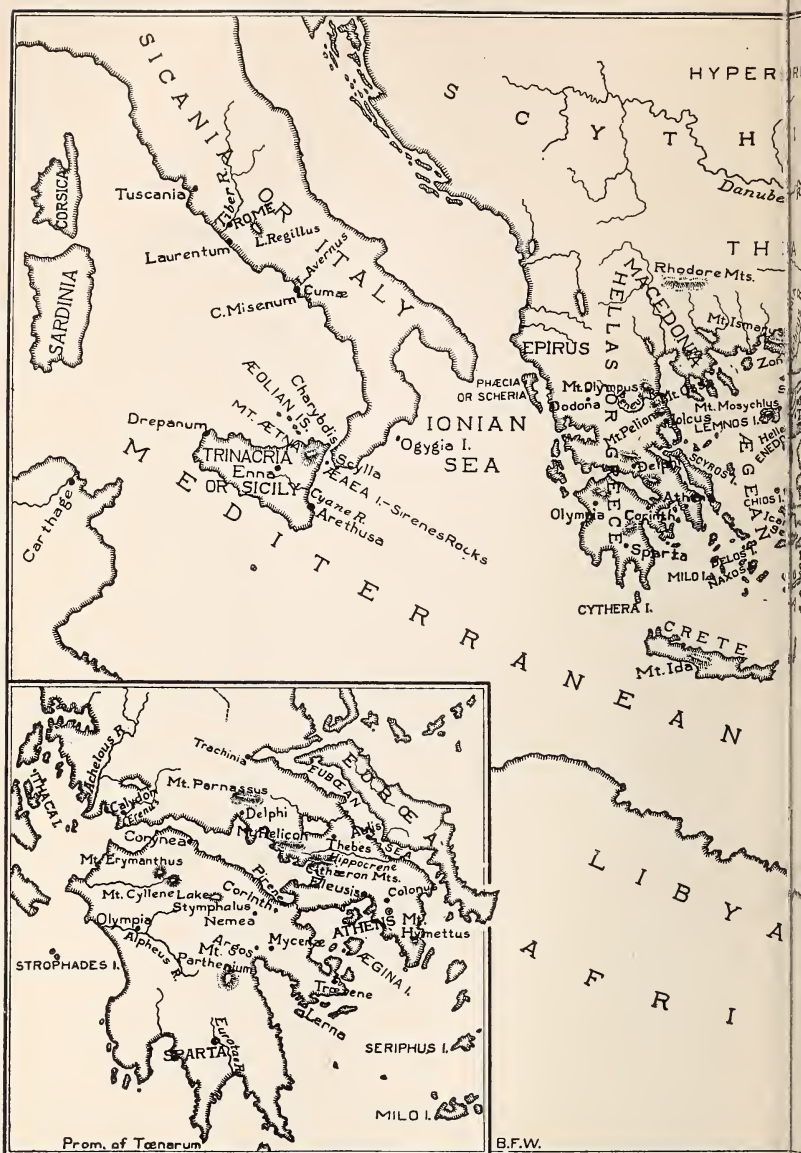
THE WORLD OF THE ANCIENT GREEKS AND ROMANS, SHOWING LOCATIONS