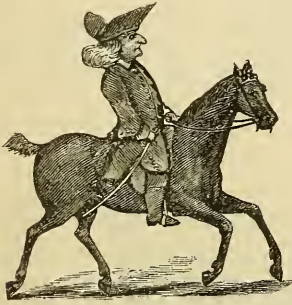
AN OLD-TIME DOCTOR.

In the bark canoe around by the water-way, or seated on a pillion strapped behind the saddle of the patient's messenger, riding double through the woods, this obstetrician would be conveyed from her own home to that of her suffering neighbor. When a wound was received or a bone broken, there was no surgeon to dress the former or set the latter. The wound, bound up as best it might be, was left for the cool water of the brook or spring to allay the pain and inflammation. The broken bone was placed at rest in that position least painful to the patient, to await the process of nature to make an indifferent cure. As soon as Philadelphia had grown sufficiently to attract physicians, one was called from there to attend important cases of surgical injuries, and as highways were opened and the settlers increased in wealth, the most thriving of them would send for the city doctor in other serious illness. This practice has continued even to our time.