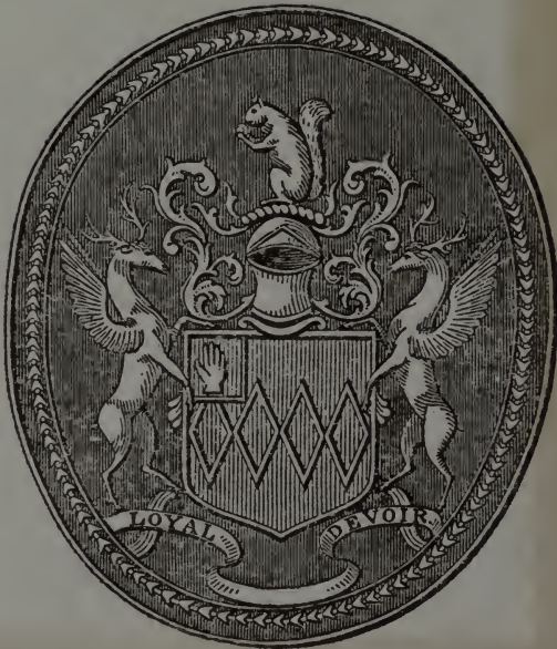
MARK OF THE CARTERET BOOK CLUB OF NEWARK

This was the coat of arms of Sir Philip Carteret, first proprietary Governor of New Jersey. He arrived in 1665 on the site of the city of Elizabeth, which he named Elizabethtown in honor of the wife of his brother, Sir George Carteret, one of the Lords Proprietors.