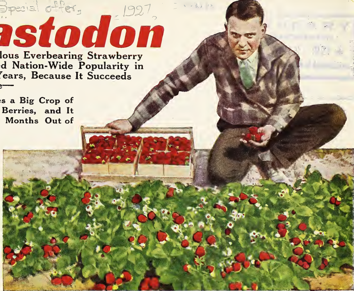
Photo engraving at right shows section of row and an 8-quart carrier of Emlong's Perfected Mastodon photographed in October. These plants were set out in April. Note the wide row and load of fruit produced—truly marvelous and unbelievable until you see it with your own eyes.

It produces a Big Crop of Immense Berries, and It Bears Ten Months Out of Eighteen.