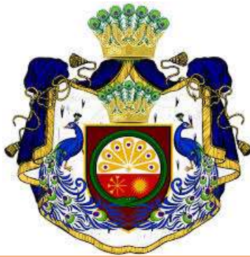
Royal Emblem Of The Ezidi Monarchy