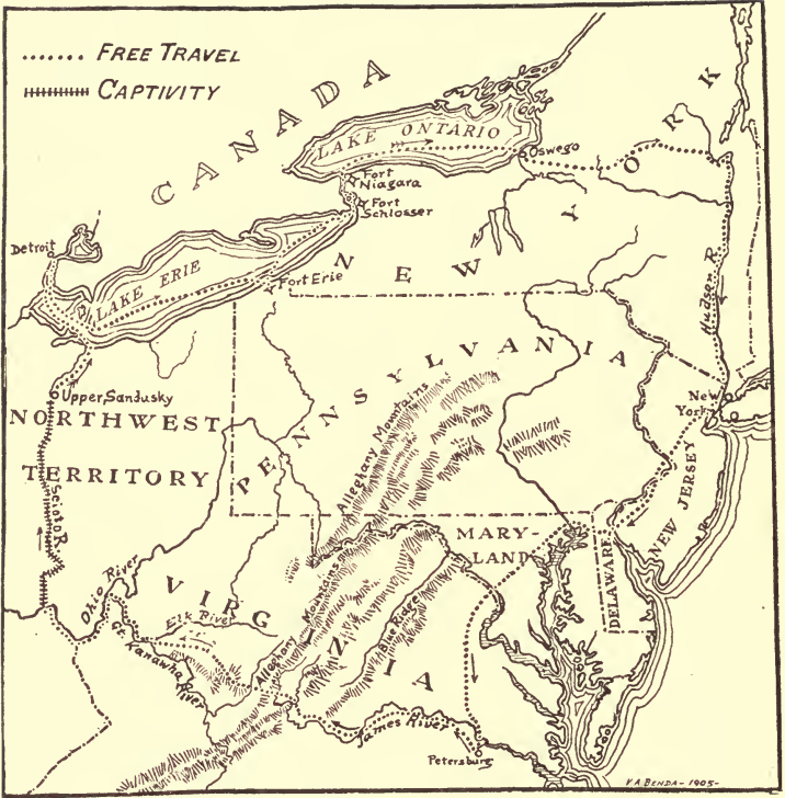
Map Showing Johnston's Route