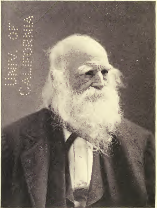
WILLIAM CULLEN BRYANT.