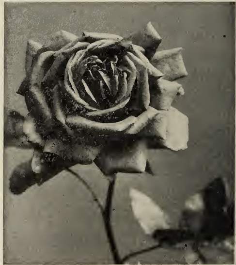
GEO. C. WAUD—For description see page 11.

Dorothy Perkins (Cl.-Wich.) This is a splendid shell-pink climbing rose. It attracted much attention at the Pan-American Exposition, where a bed of 14-month-old plants produced a show of bloom unequaled by any other variety, unless it was the famous Crimson Rambler. This rose is of the same strong habit of growth as Crimson Rambler. The flowers are large for a rose of this class, very double, sweet-scented and