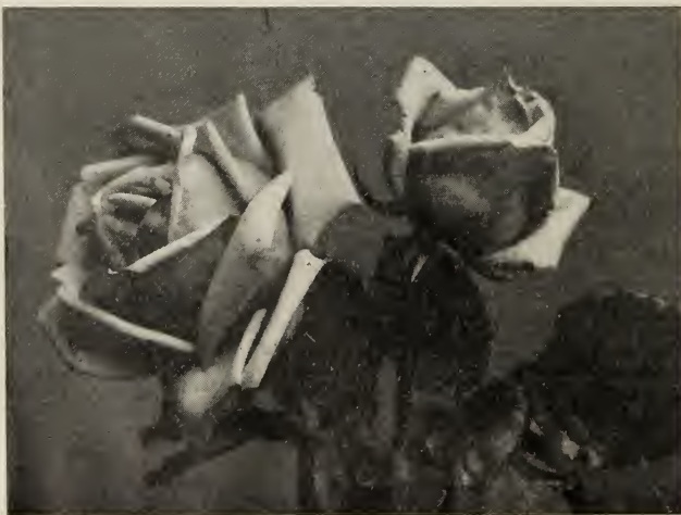
JONKHEER J. L. MOCK—For description see page 9.

PRUNING —Old and decayed branches, and about one-half the previous season’s growth, should be cut away early in the spring, while they are still dormant, and after the first bloom, a little cutting back, usually about the middle of September, will insure late flowers. As a rule prune close for size and quality, or what is known as exhibition flowers. For quantity or garden decoration follow same course with weak, old or unripe wood but do not cut back the strong thrifty shoots so severely. In shortening always prune to an “eye” pointing away from the center of the plant.