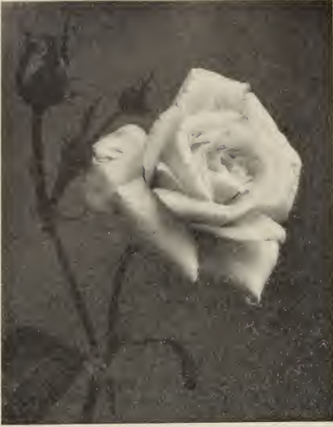
SUNBURST—For description see page 10.