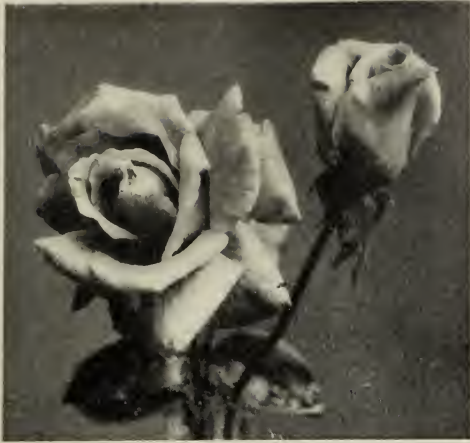
COUNTESS OF GOSFORD—Description page 10.