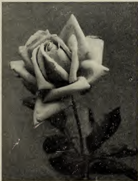
LADY ASHTOWN—Description page 11.

Frau Karl Druschki (H.P.) Has been well named White American Beauty. A wonderful rose, such as our people have long been waiting for—fine, large, free-flowering, hardy, white. Extraordinarily strong-growing, branching freely, foliage large, of heavy texture, but the glory is in its flowers, which are immense, and produced with great freedom, during the whole season; petals broad, long and saucer-shaped. Buds egg-shaped long and pointed. Pure, snow-white, without a tinge of yellow, pink or any other color.