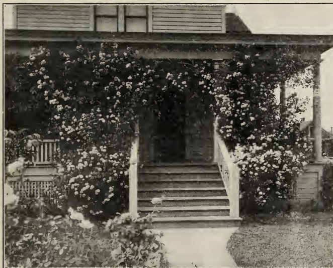
BEAUTIFUL CLIMBING ROSES.

Reve d'Or (Cl.-N.) One of the grandest climbing roses. A splendid robust climber, with the very best of foliage. A good plant will soon go to the top of a two-story house and cover space proportionately large the other way. Color apricot-yellow, with orange and fawn tints; petals of superb and delicate texture; flowers moderate-full, always pretty and graceful, whether in bud or full open; a very profuse bloomer.