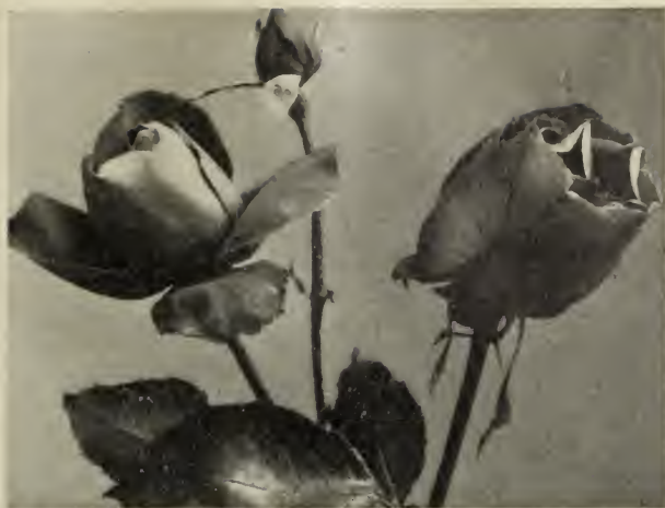
EDWARD MAWLEY—For description see page 8.