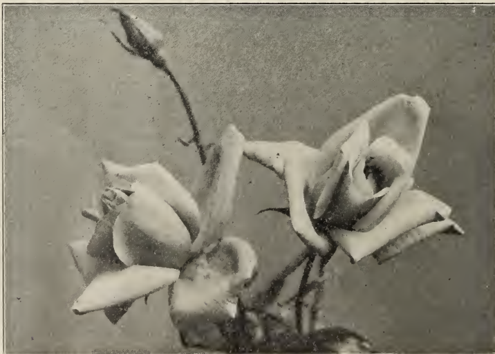
BETTY—For description see page 10.