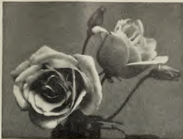
LADY HILLINGDON—For description see page 9.

When planting prune all roses severely. In Fall planting prune the following spring, and when planted in the spring prune at time of planting.