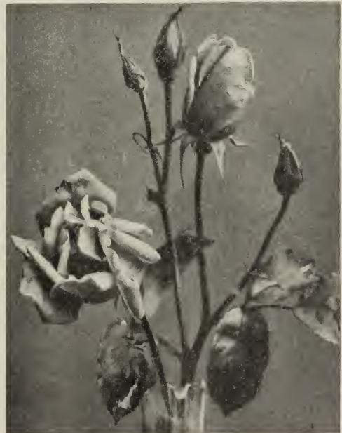
DUCHESS OF WELLINGTON—Description page 8.