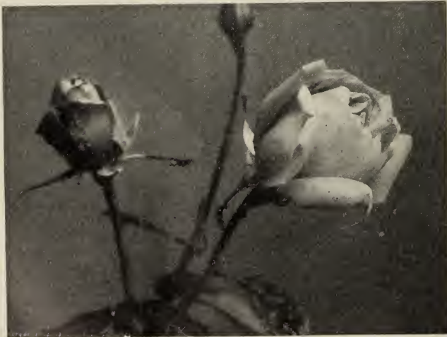
RAYON D'OR —For description see page 9.

Betty (H. T.) Dickson & Sons, 1905. (Gold Medal) "A rose of great merit; decidedly good as a long-stemmed rose for house decoration."—Gardeners' Chronicle. Copper rose of lively tint, shaded with golden yellow at the base. The growth is strong and vigorous and well furnished with thick leathery foliage. Buds long and pointed.