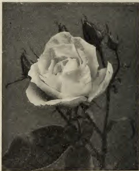
WHITE KILLARNEY—Description page 18.

Marie Van Houtte (T.) White, slightly tinged with yellow. Free grower and fine bloomer.