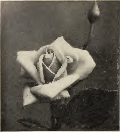
JOSEPH HILL—For description see page 11.