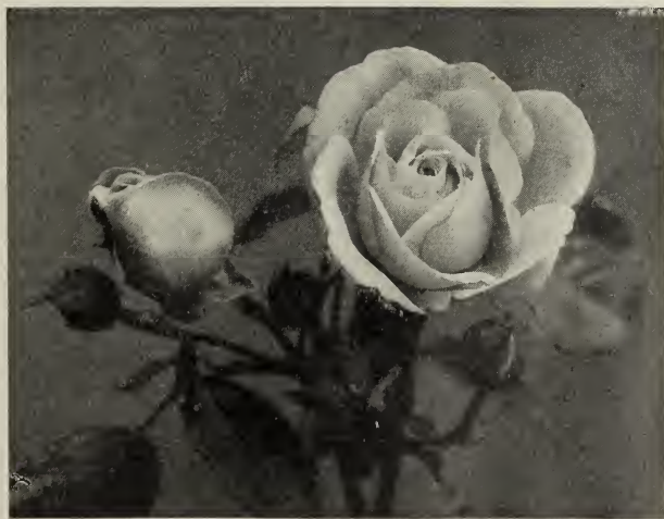
MAD. RAVARY—For description see page 12.

Rayon d'Or (Pernetiana) Pernet-Ducher, 1910. A superb new novelty from France which is unquestionably the yellowest of yellow roses in cultivation, and probably no rose in cultivation today possesses the remarkable coloring of this new rose. A cross between Madam Melanie Soupert and Soliel d'Or . A vigorous grower, of fine branching habits; fine bronze-green foliage and oval shaped buds tinged coppery-orange. It is not only very attractive in the bud, but equally so when flowers are expanded on account of its