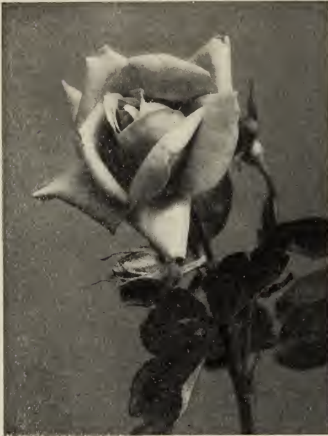
LYON ROSE —For description see page 11.