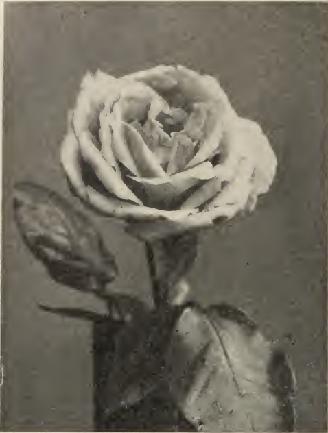
EARL OF WARWICK—Description page 10.