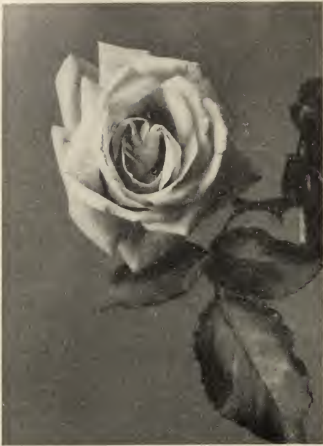
MY MARYLAND—For description see page 12.