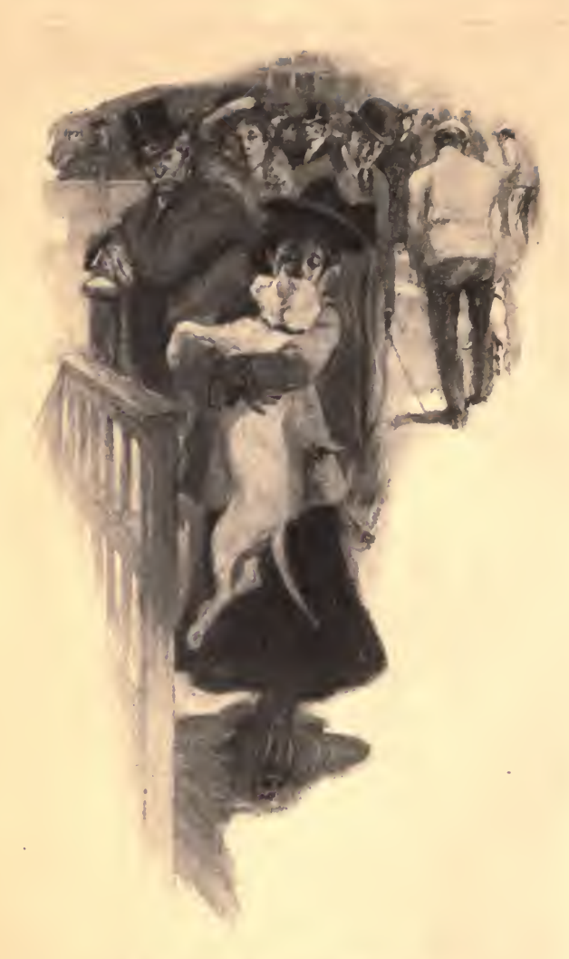
"Miss Dorothy snatches me up"