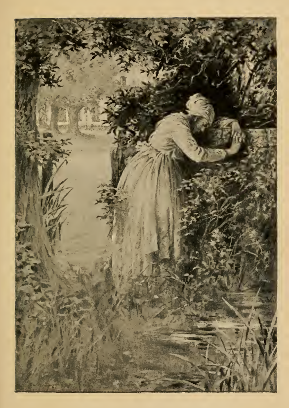
"Woe is me, my stolen daughters!"