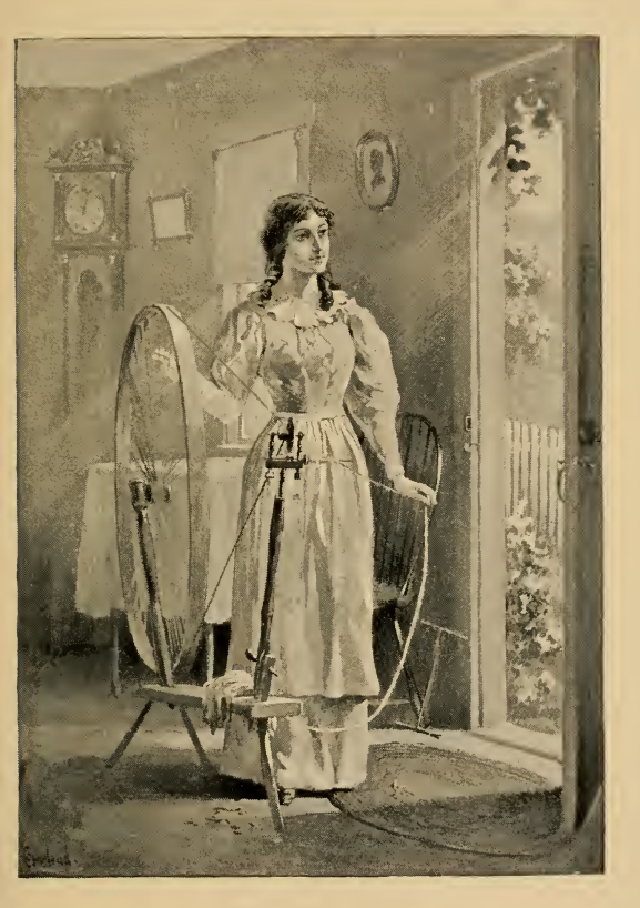
The Yankee Girl.