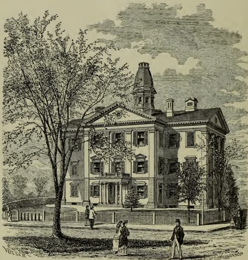
STATE NORMAL SCHOOL, BRIDGEWATER, MASS.