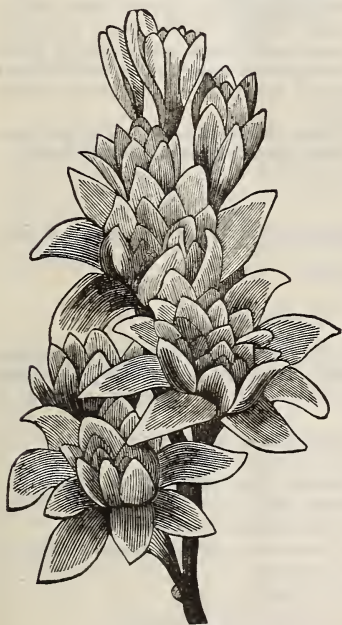
PEARL TUBEROSE. (See page 47.)