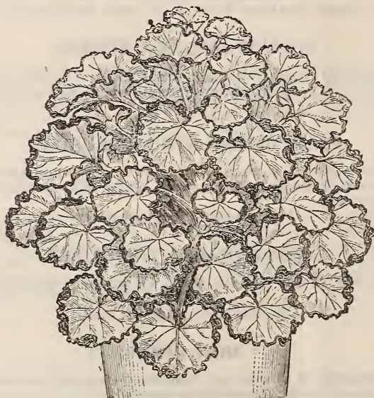
GERANIUM, FREAK OF NATURE.