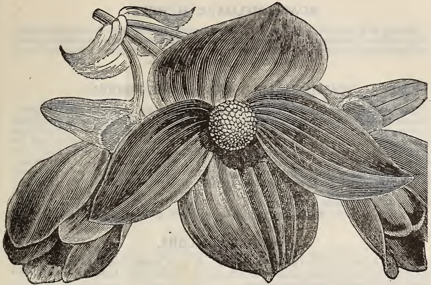
TUBEROUS-ROOTED BEGONIA. (See page 2.)