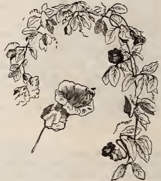
COBÆA. (See page 25.)