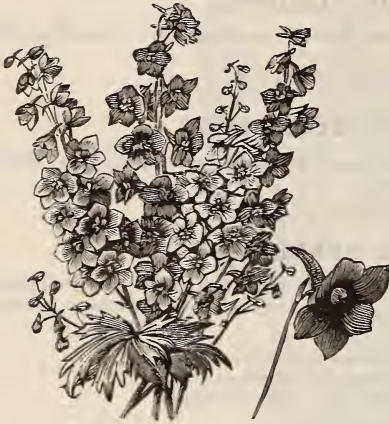
DELPHINIUMS. (See page 7.)