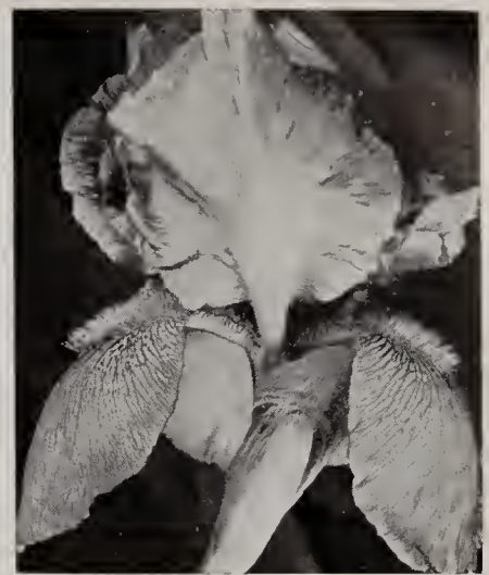
Iris Crimson King