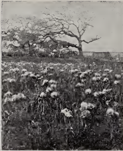
Iris Susiana—In Field