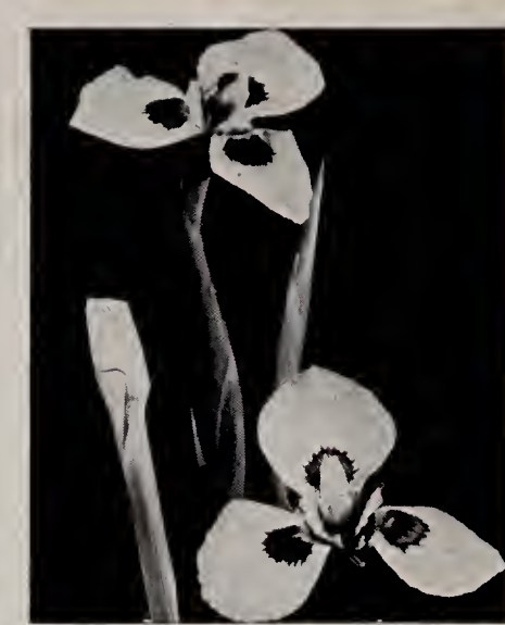
Iris Pavonia (Moræa Glaucopis)