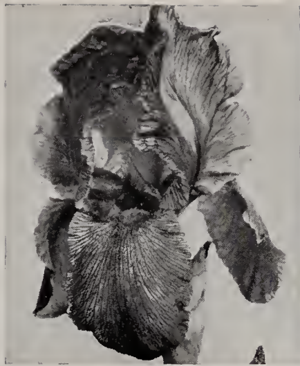
Iris Wm. Mohr