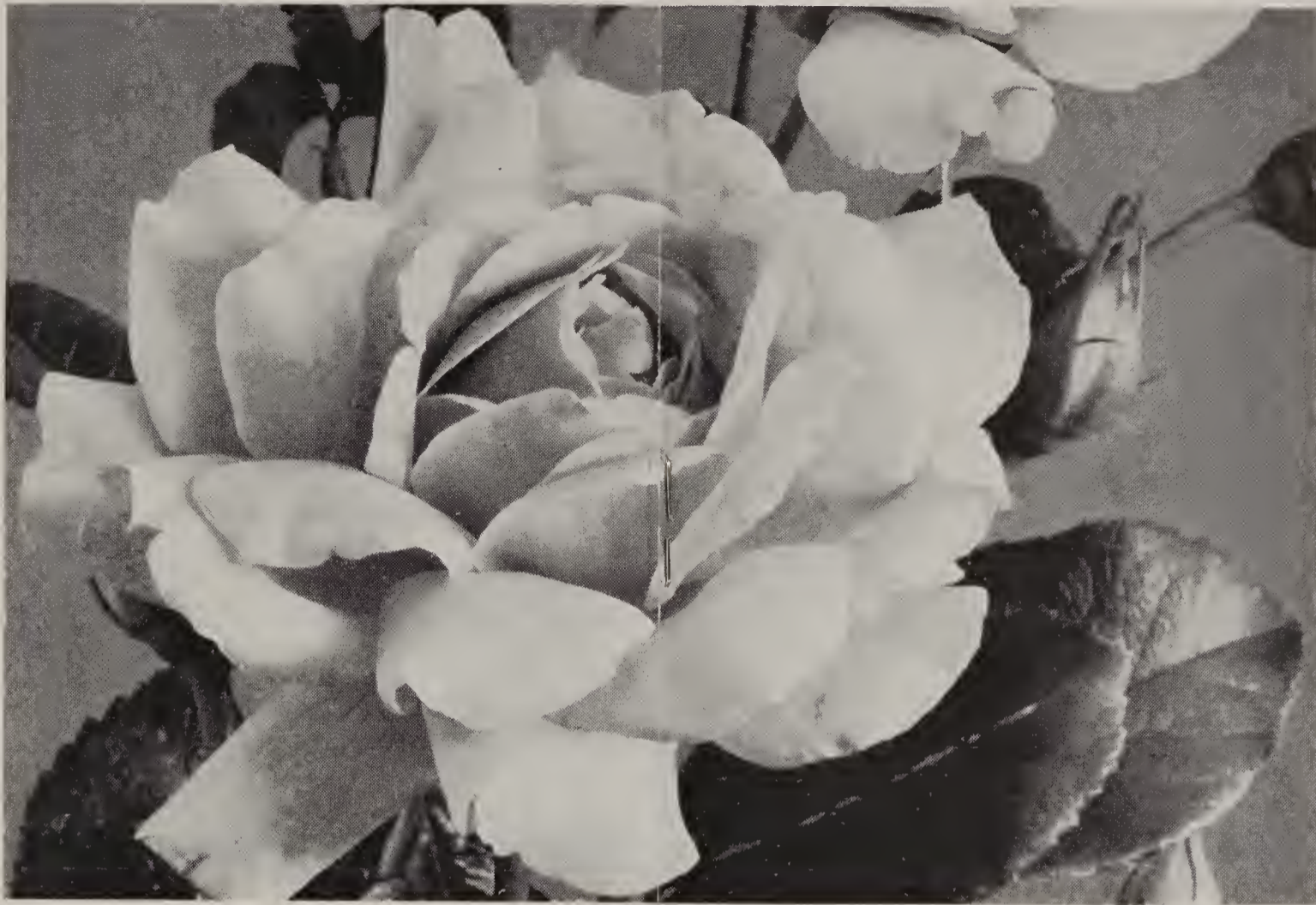
Note abundant petalage and grace of this novelty: Ramon Bach