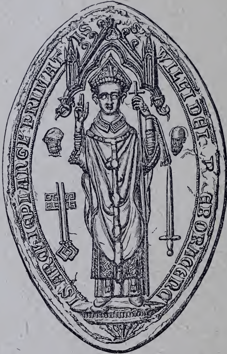
FIG. 5.—SEAL OF WILLIAM GREENFIELD, ARCHBISHOP OF YORK, 1304-15 ( \frac{1}{2} ).

are those of bishops, with which for the present purpose may be grouped those of abbots and priors. In these, which, with but few exceptions, are of vesica shape, the bishop is represented standing,