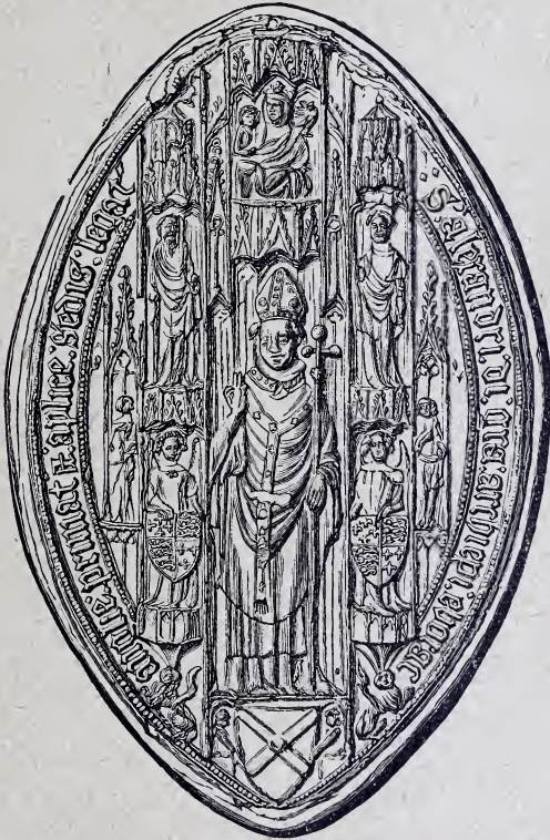
FIG. 6.—SEAL OF ALEXANDER NEVILL, ARCHBISHOP OF YORK, 1374–88 (?).

a while additions were made to the design with the purpose of filling up the blank space on either side of the figure. A gem was sometimes inserted here,