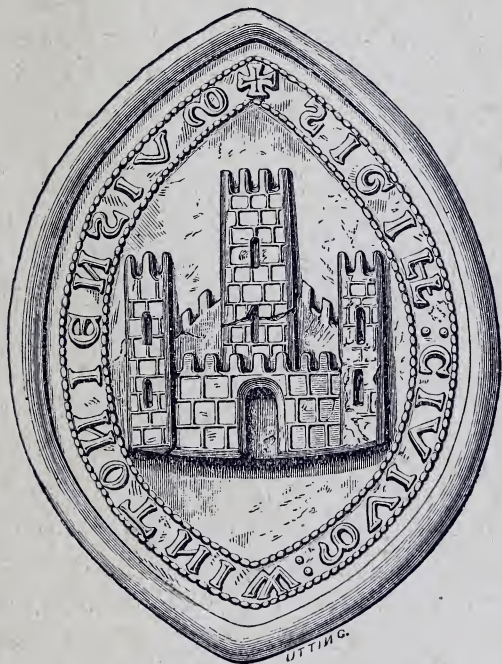
FIG. 4.—SEAL OF THE CITY OF WINCHESTER (†).

DE ECHINGEHAM on that of Sir William Echingham (Fig. 12); and s. GERARDY : BRAIBROK on that of Gerard Braybrook (Fig. 10). The seal of the city of Winchester is inscribed SIGILL' : CIVIVM : WINTON-