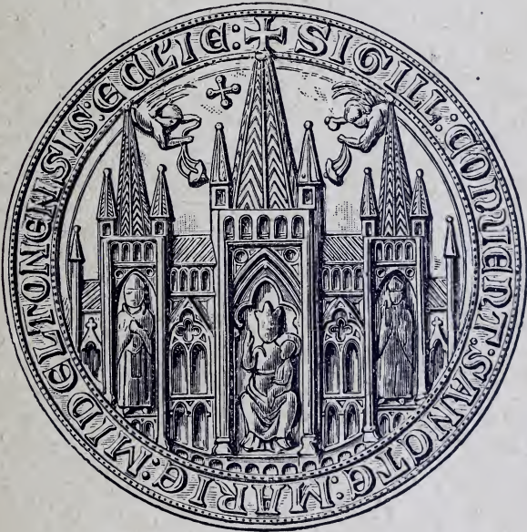
FIG. 7.—SEAL OF MILTON ABBEY, DORSET (1).

Rochester with St. Andrew on his cross, or of the monastery of Bury with St. Edmund the King and Martyr. The Virgin and Child was naturally a very usual subject and examples are numerous. A fine early example is on the late twelfth-century