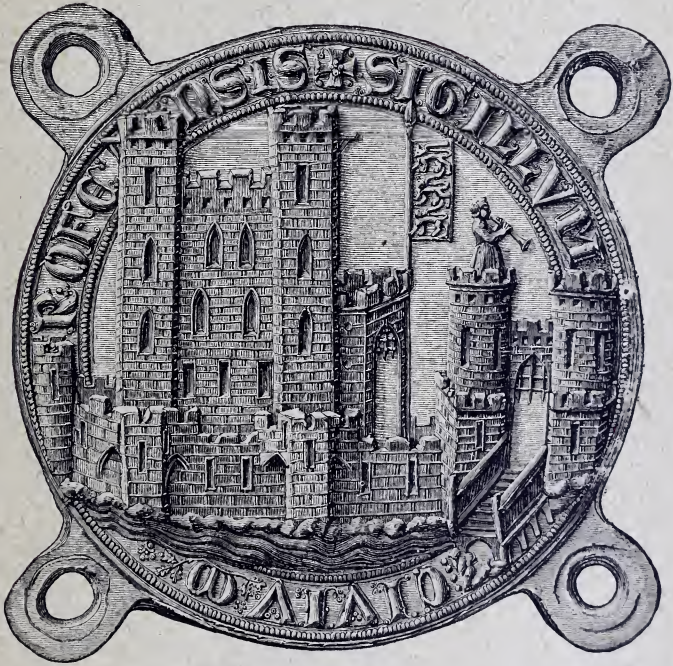
FIG. 9.—COUNTER-SEAL OF THE CITY OF ROCHESTER (†).