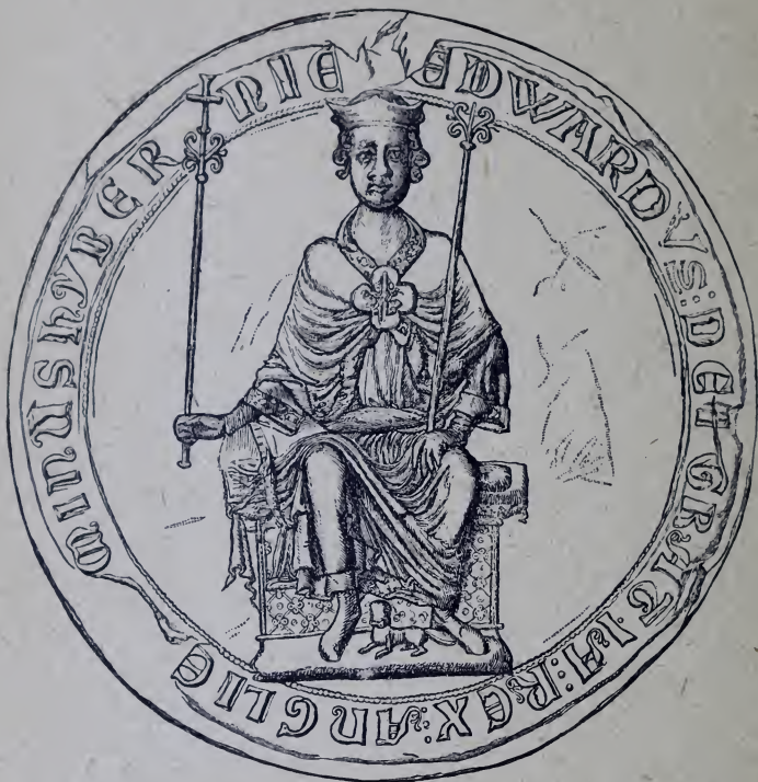
FIG. 1.—OBVERSE OF SEAL OF ABSENCE OF EDWARD I. (1).