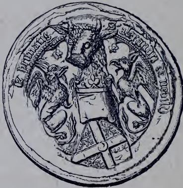
FIG. 11.—SECRET OF ALEXANDER NEVILL, ARCHBISHOP OF YORK (1).

of the sheaf of peppercorns which serves as his crest; or of Richard Beauchamp, Earl of Warwick, 1401, who shows the bear and ragged staff. Banners of arms are also found, as on the seals of William, Lord FitzHugh and Marmion, 1429, and Margaret Lady Hungerford, 1462, as well as on the seal of Walter himself. Where all these heraldic seals are beautiful it is difficult to choose any for