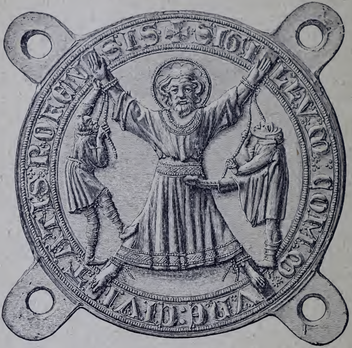
FIG. 2.—SEAL OF THE CITY OF ROCHESTER (1).