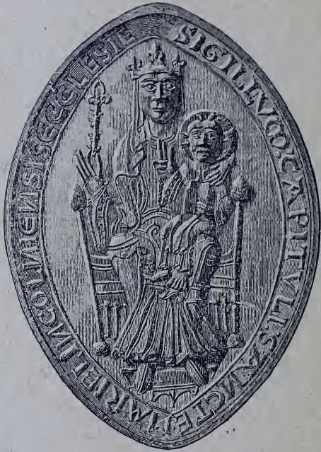
FIG. 3.—SEAL OF THE CHAPTER OF LINCOLN ( \frac{1}{2} ).

this latter language becomes common by the seventeenth century. The simplest form begins with the word "sigillum" or "secretum," as the case may be, followed by the owner's name and rank in the genitive case. Kings and sometimes bishops