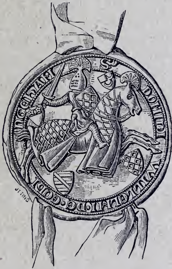
FIG. 12.—SEAL OF SIR WILLIAM DE ECHINGHAM, died c. 1331 (†).

Equestrian figures are common on the private seals of the great barons and magnates, as, for example, those of Gilbert de Clare, Earl of Gloucester and Hertford, died 1295, Thomas Beauchamp, Earl of Warwick, 1343, and Richard Nevill, the King Maker, c. 1460, where the figures are in armour,