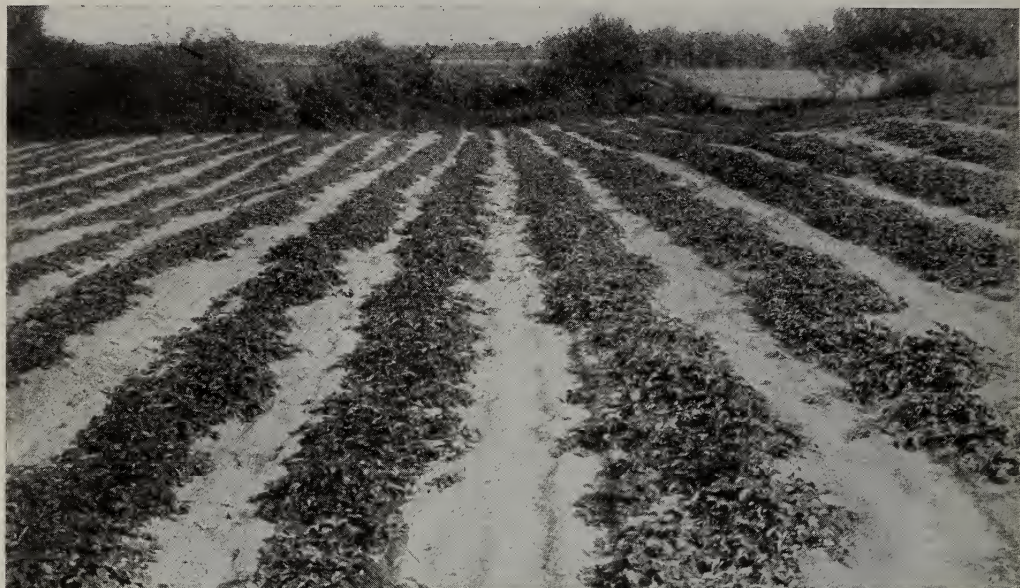
A corner of one of our fields from which plants will be dug to supply our customers this year.