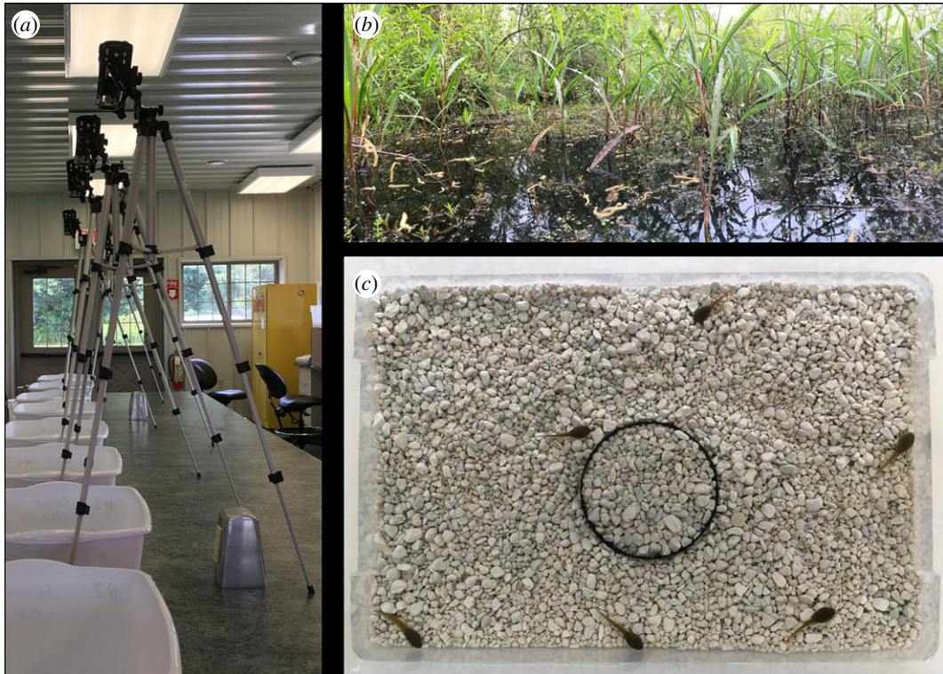
Figure 1. Experimental set-up. (a) Tripod-mounted cameras used to film behavioural assays. (b) Pond-edge habitat from which egg masses were collected. Tadpoles were placed individually into 15 l tubs and filmed for 10 min to quantify the proportion of time spent at the edge of the tub versus the centre. (c) Image of environmental exposure experiment. Tadpoles spent 24 h in a 15 l tub containing a white pebble substrate with a 100 mm diameter section containing pebbles that had prior exposure to J. lividum . The exposed section is denoted with black edges.

selected individual and exposed it to the defensive bacterial symbiont J. lividum for 24 h. We then placed the exposed individuals and their unexposed group-mates into a separate tub and allowed them to interact naturally for 24 h. In the Environmental Acquisition experiment ( n = 9 groups), we exposed a patch of aquarium pebbles to J. lividum and then placed it into a field of unexposed, sterilized pebbles. We then moved social groups from their housing tubs into the tubs containing exposed pebble patches and left them undisturbed for 24 h (figure 1c). Finally, we isolated each individual and swabbed their skin to estimate the presence of J. lividum by counting bacterial colony-forming units on selective growth media.