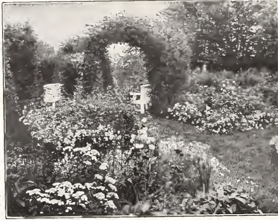
Effective Planting of Hardy Perennials

SEED —Any of above, except where otherwise noted: Pkt. 10c; 3 pkts. 25c; 13 pkts. for $1.00, postpaid.