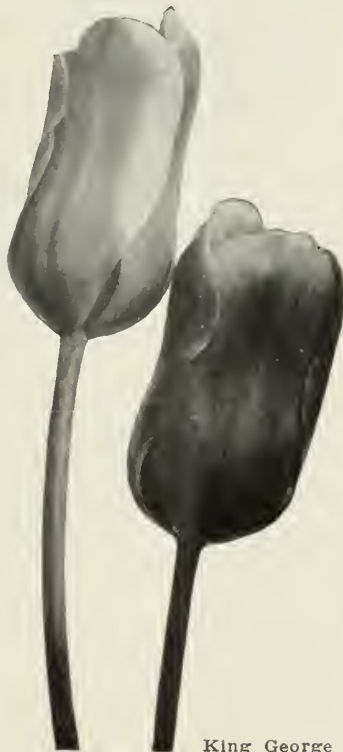
King George V

DARWIN TULIP BULBS are very cheap this year, far below normal prices and perhaps much lower than we can expect in the future. Now is the chance to fill up every "nook and cranny" with these wonderful flowers at little cost.