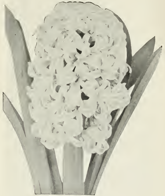
Single Dutch Hyacinth

Extra Large Top Root "Mother Bulbs" of the above varieties. Each 35c; $3.25 per doz.; $25.00 per 100.