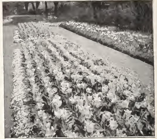
Beds of Single And Double Early Tulips Plant them by the hundreds

Our Tulip Bulbs are all top size and are not to be compared with the small undeveloped cheap grades that are offered at so-called bargain prices.