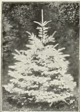
Colorado Blue Spruce

Norway Spruce (P. excelsa) —A compact, symmetrical tree; the branches assuming a graceful, drooping habit with age. Cones very large. Foliage light green in this climate. Extremely hardy and of rapid growth. The original Christmas tree of northern Europe. 1½-2 ft., $3.00 each; 2-3 ft., $4.50; 3-4 ft., $6.00 each.