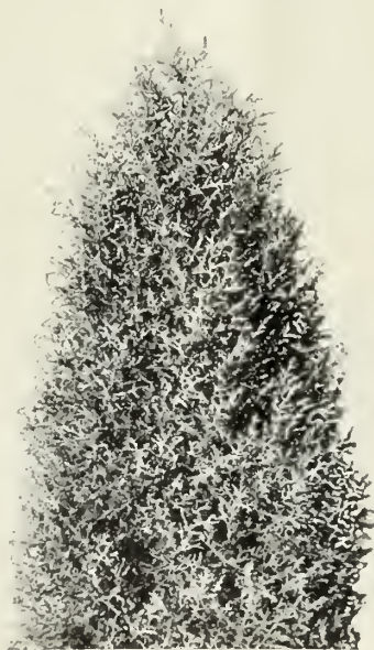
Silver Blue Cedar

Mugho (Dwarf Pine) —Leaves short, stiff and formal, thickly distributed in tufts over the branches in a crowded way somewhat similar to Austrian, with an equal depth and richness of color; globular form. 15-18 inches, $5.50 each.