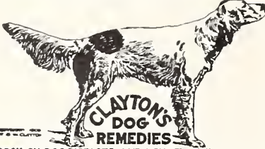
BOOK ON DOG DISEASES-AND HOW TO FEED-FREE

We are now booking orders for Fall and Early Spring delivery. Write us for special prices naming quantity, breed and time delivery is desired.