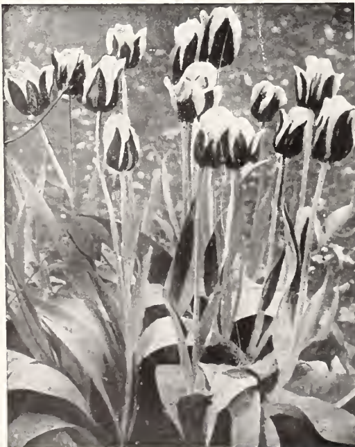
Kaiser Kroon Tulips

Varieties marked (*) are good for indoor culture.