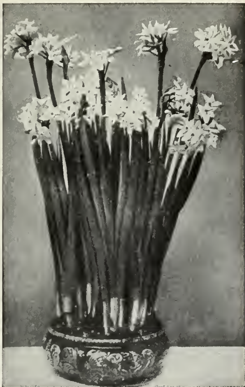
"Giant White" Narcissus