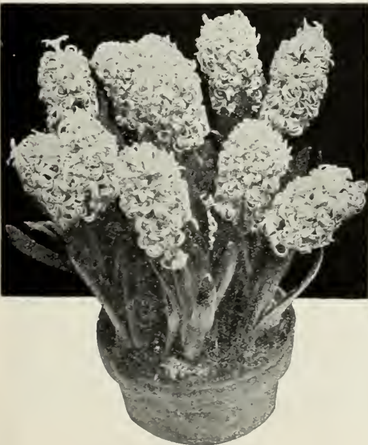
A Pot of Single Hyacinths