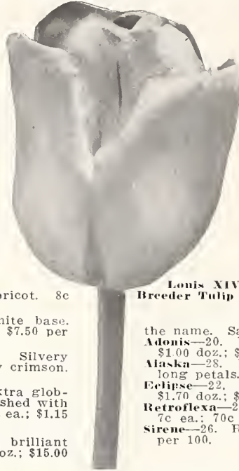
Louis XIV Breeder Tulip

Panorama —(Fairy) 20 in. Deep orange-red shaded mahogany, very fine. 7c ea.; 65c doz.; $4.50 per 100.