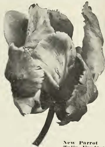
New Parrot Tulip Fantasy

Price any of above, 6c ea.; 60c doz.; $4.00 per 100.