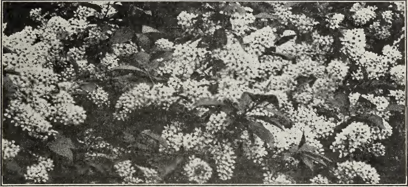
Close-Up View Of The Flowers Of The May Day Tree