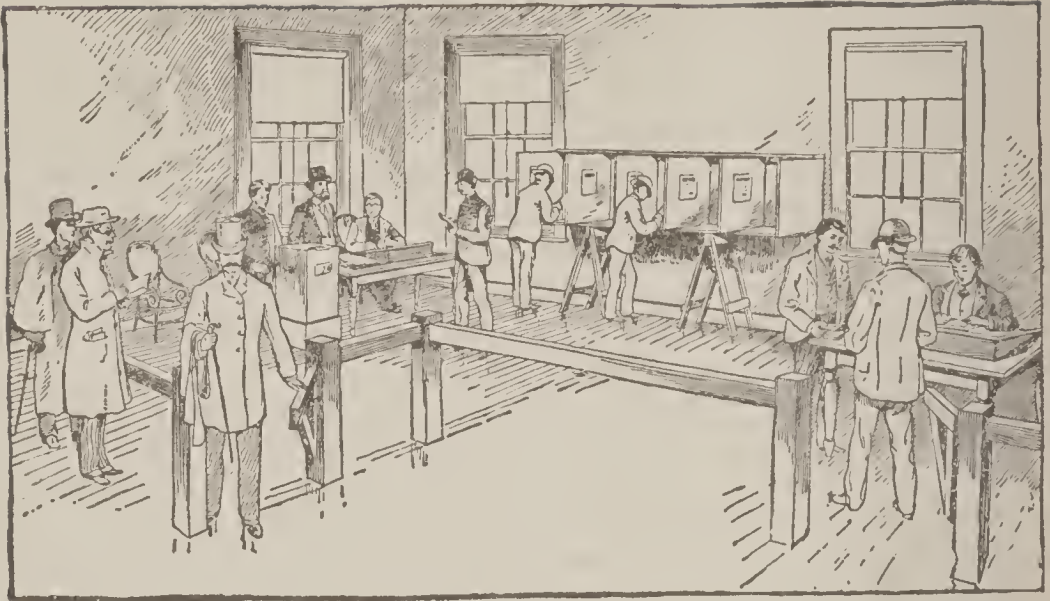
SKETCH OF POLLING PLACE.