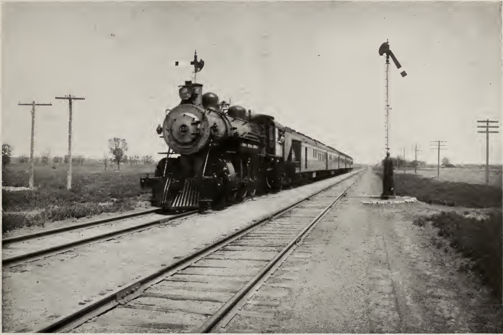
Double-track, safety-signal line of the Union Pacific System On the official route of our tours

ment roads from this point, winding through the Park, bring the tourist to the cardinal attractions in their proper sequence. Old Faithful Inn is in the heart of the Upper Geyser Basin where all the great geysers are located. You can sit on the broad gallery of the Inn and watch Old Faithful play only 200 yards away! During the afternoon our Travel Representative takes the party over the Basin. By nightfall you will agree that this is the "most weird spot in the Universe."