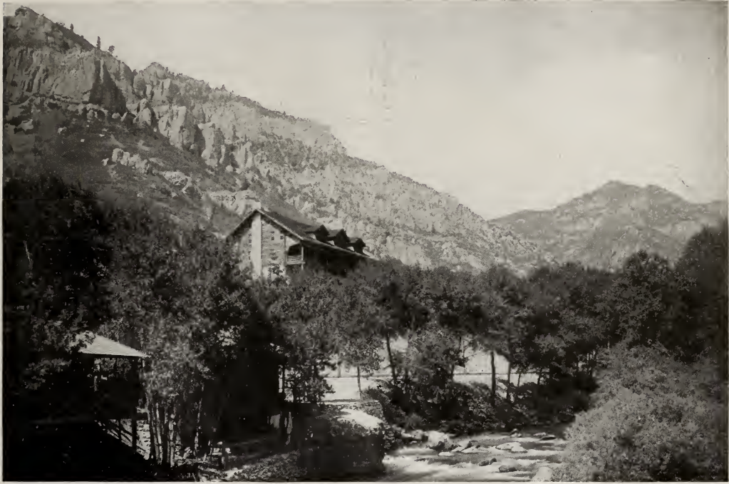
Hermitage Hotel in Ogden Canyon. Our train stops six hours for a side-trip up this famous canyon