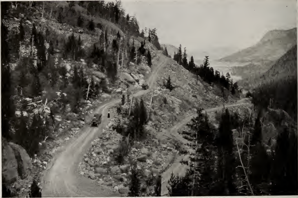
The Fall River Drive, Rocky Mountain National Park, one of the new motor roads traveled by our tours