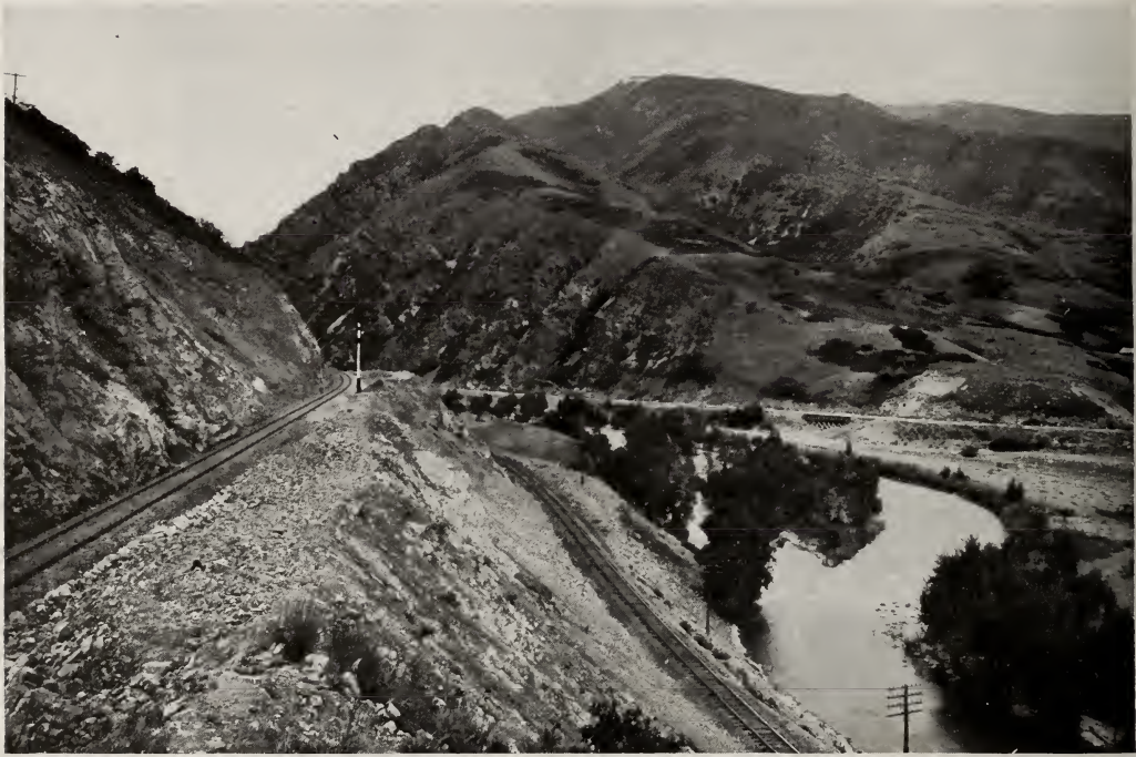
Weber Canyon, Utah. In center and at left are double tracks of Union Pacific At right is the Lincoln Highway

Dunraven Pass, visiting Tower Falls and the strangely different Second Canyon of the Yellowstone. (See illustration.) This part of the Park, opened up by the advent of the auto, gives Yellowstone a new highway, the Chittenden Road, which is superior, scenically and from an engineering standpoint, to any other road in the Yellowstone region. "Bow-knot" curves, lofty passes, broad vistas, towering overhanging cliffs, pinnacles, waterfalls, wild game and wild flowers make up a partial list of the attractions on this new route.