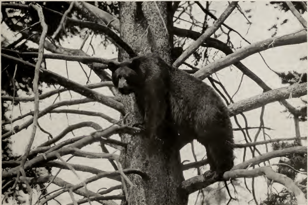
Take your camera to Yellowstone and bring home pictures like this of the bears and other wild animals