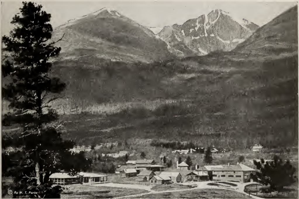
Longs Peak (at right) altitude 14,256 feet, and Longs Peak Inn Our guests make a motor side-trip to this famous Lodge