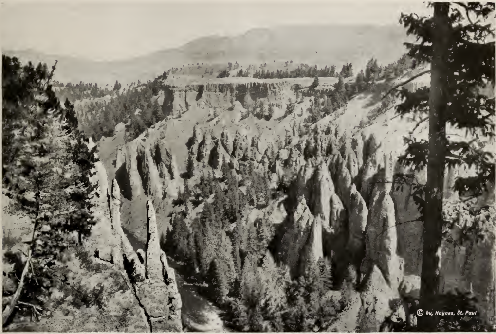
Lower Canyon of the Yellowstone, a new part of the Grand Canyon opened by the advent of the automobile