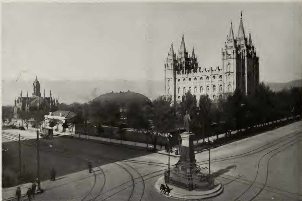
Temple Square, Salt Lake City, showing Mormon Temple, Tabernacle and heroic statue of Brigham Young

and sheer depths is not equaled elsewhere in the Rocky Mountains. Turn at once to the frontispiece of this book and witness the camera's verification of this statement. At 5:30 PM our motor cars are due at the Stanley Hotels, the aristocrats of this region. They overlook the village and command an all-encircling view of the mighty mountains. In furnishings, service and cuisine, they are the peer of any western resort hotels. An estate of several thousand acres affords their guests the privilege of golf, tennis and croquet.