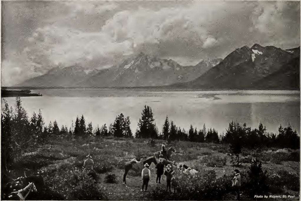
Jackson Lake and the Tetons, new southern entrance to Yellowstone Park. Supreme in scenic splendor