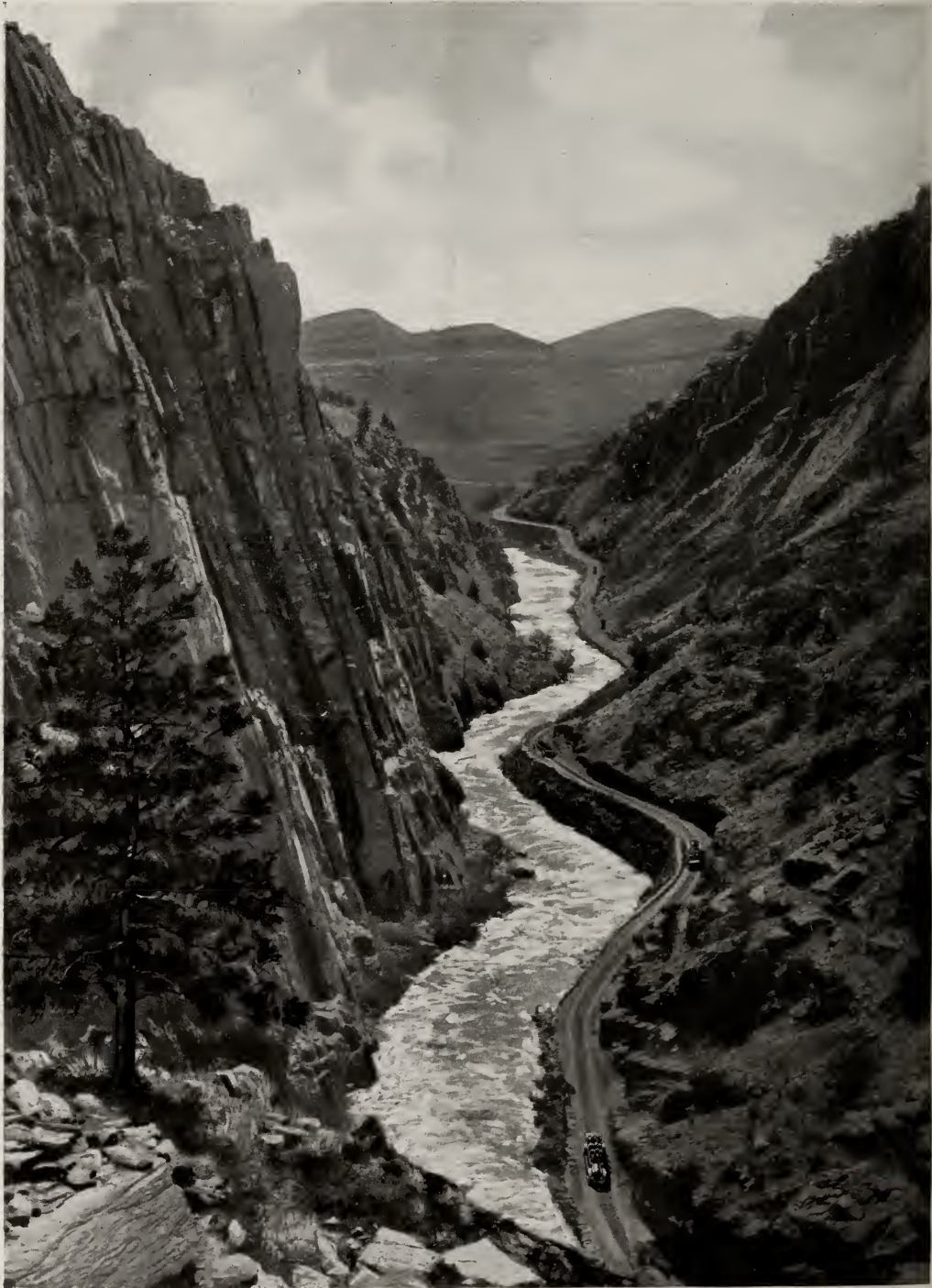
Big Thompson Canyon, front door to Rocky Mountain National Park, and the finest canyon drive in the West