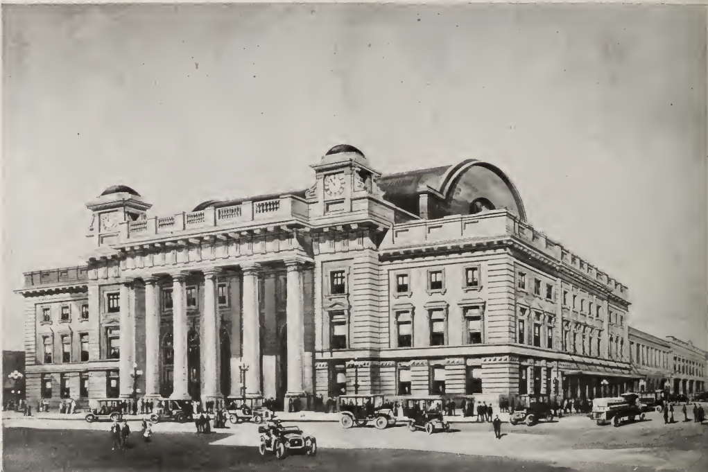
Chicago Terminal of the Chicago & North Western Railway All our tours leave this magnificent station

reserved in advance and you embark on a 5 days auto tour that will realize all your dreams.