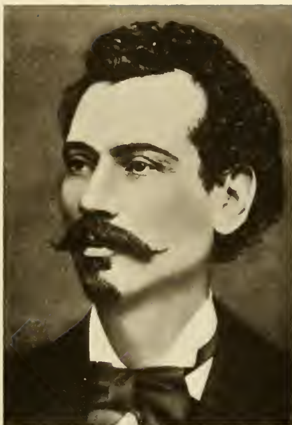
PEREZ BEN MOSHEH SMOLENSKIN