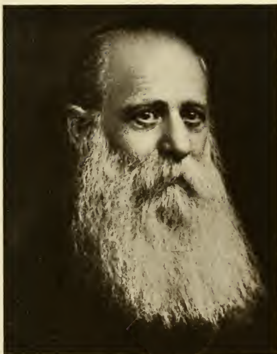
MOSES LÖB LILIENBLUM 1843-1910