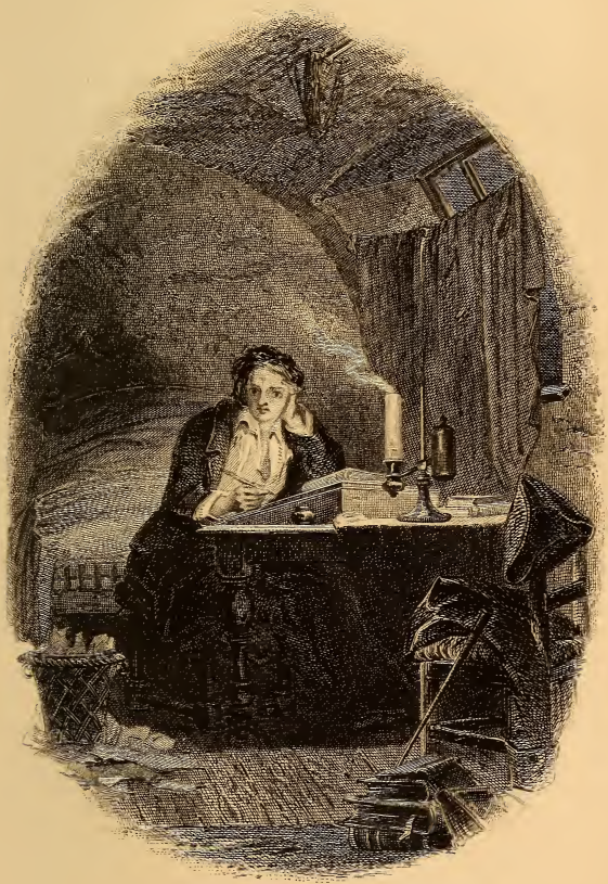
See the lone Bard at midnight study sitting, O'er his pale features streams his dying lamp.