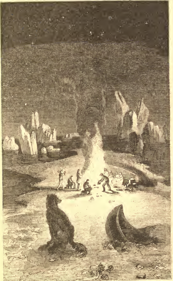
THE SANDBANK. Page 104.