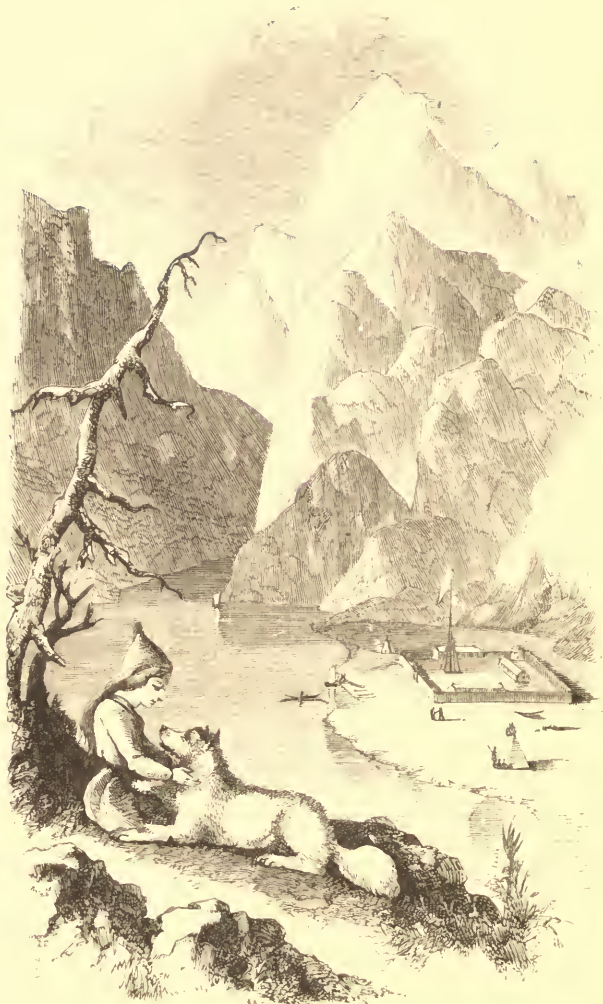
EDITH AND CHIMO AT UNGAVA Page 193