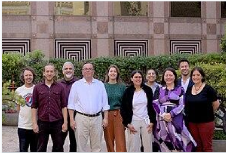
Group photo taken at the July all-staff meeting in San Francisco

In July, we held our summer all-staff meeting in the Bay Area. We had shortened the duration of the event by one day, resulting in a 3-day all staff in downtown San Francisco. On day one, we celebrated the successes of last fiscal year and created a shared understanding of the new strategy and the plan for the year ahead. On the second day, we had a couple of peer-learning activities ( Wikipedia through the eyes of a new contributor , How to communicate with diverse audiences , Thoughts on returning instructors ), and also engaged in a risk-assessment exercise to figure out how generative AI could influence our work. Both day one and day two also provided time for performance reviews, as well as individual and group meetings. The third and last day is traditionally reserved for a social activity. Connecting amongst each other has become even more important since we moved Wiki Education to fully remote at the beginning of the pandemic. This year, we went to a Japanese-vegetarian restaurant in San Francisco's Mission District, before taking a Mural Tour near Precita Park.