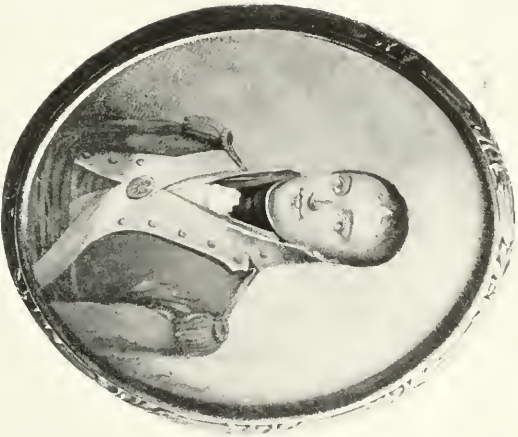
GOV. WM. C. C. CLAIBORNE