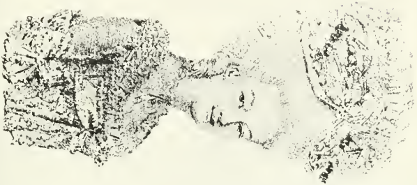
MARGARET SHIPPEN By Major John André