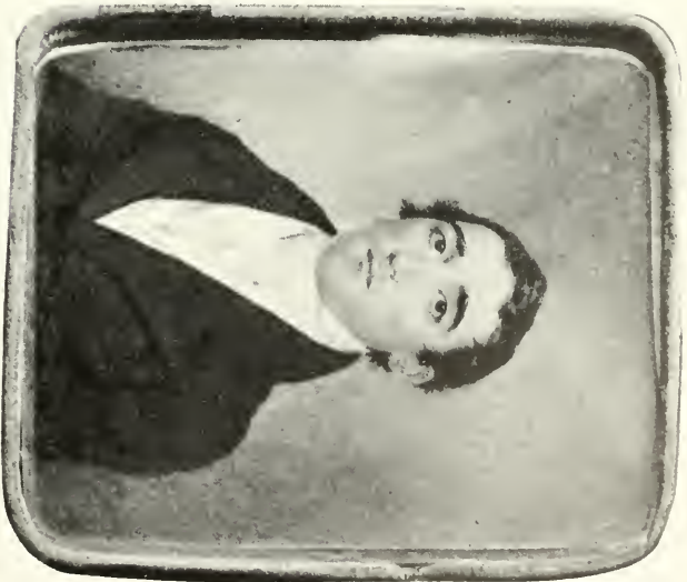
SAMUEL LARKIN By HENRY WILLIAMS Museum of Art, Worcester, Mass.