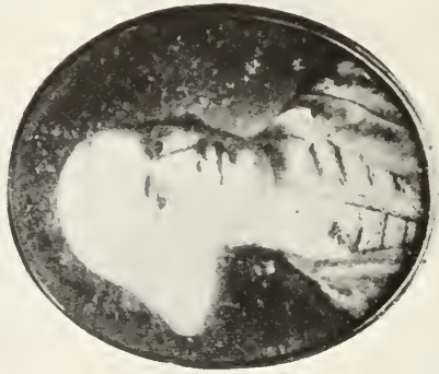
JOHN SINGLETON COPLEY