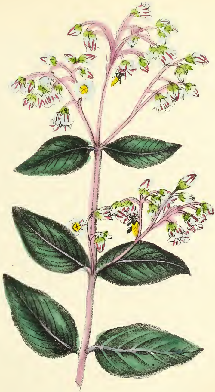
Apocynum Androsae multiflorum?