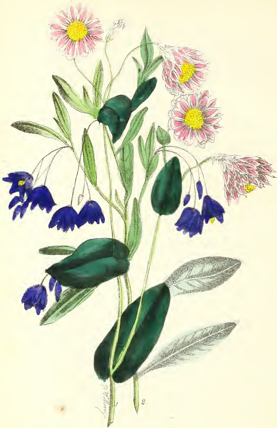
1. Rhodanthe Manglesii . 2. Sollya heterophylla .