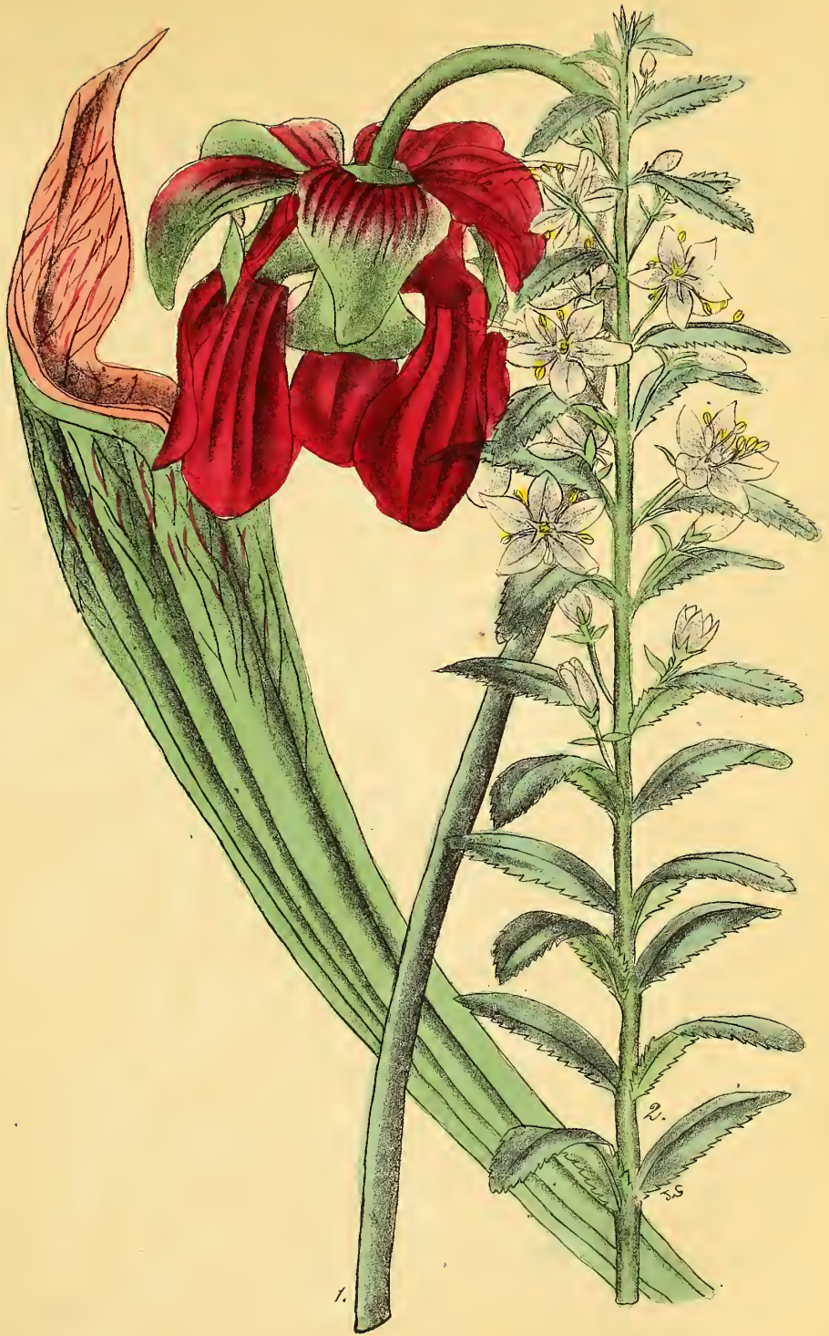
1. Sarracenia rubra . 2. Barosma cremulata .