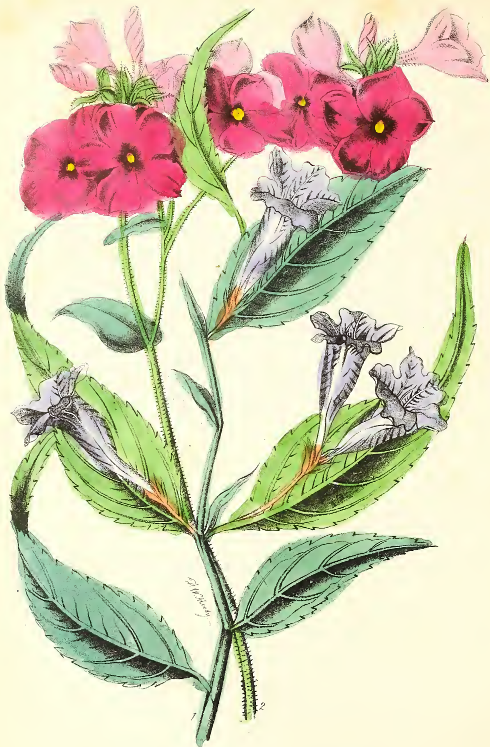
1. Goldfussia anisophylla . 2. Phlox Drummondii .