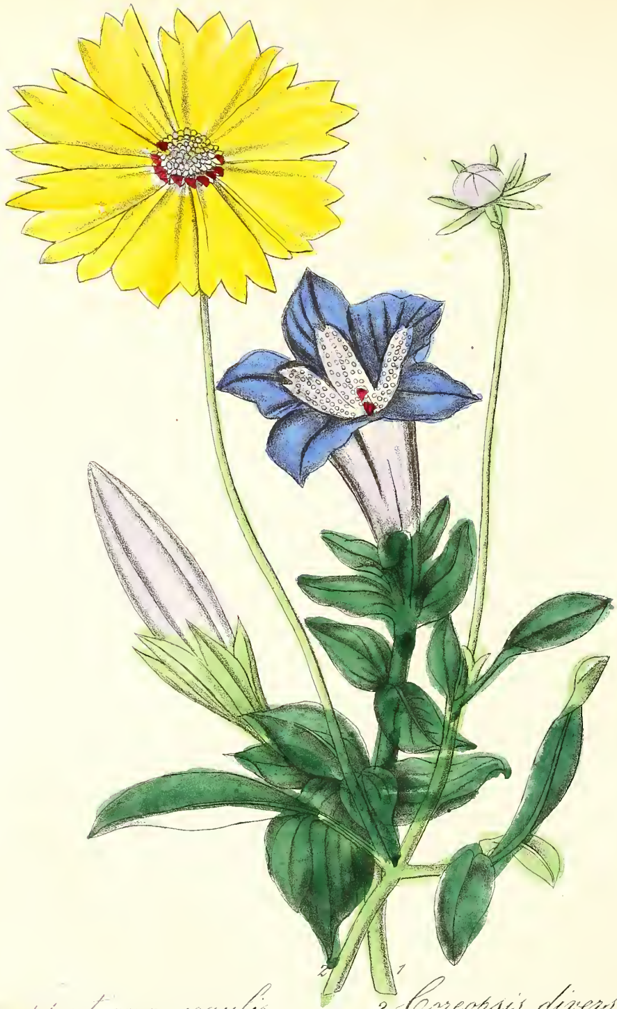
1 Centaurea acaulis .