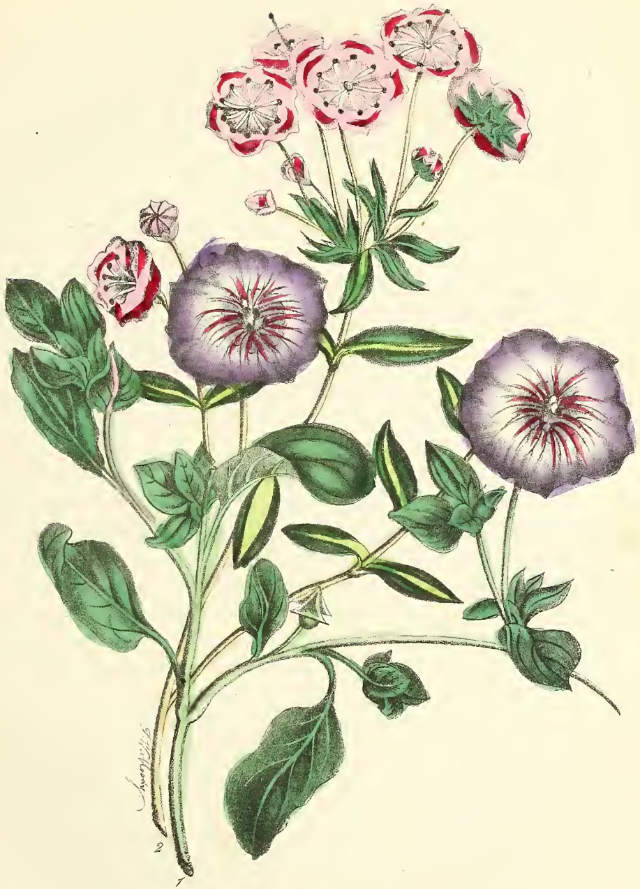
1. Nolana prostrata . 2. Kalmia glauca .