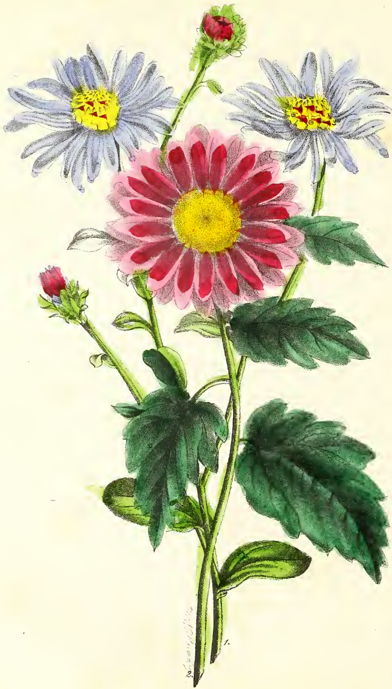
1. Aster amellus . 2. Aster chinensis .