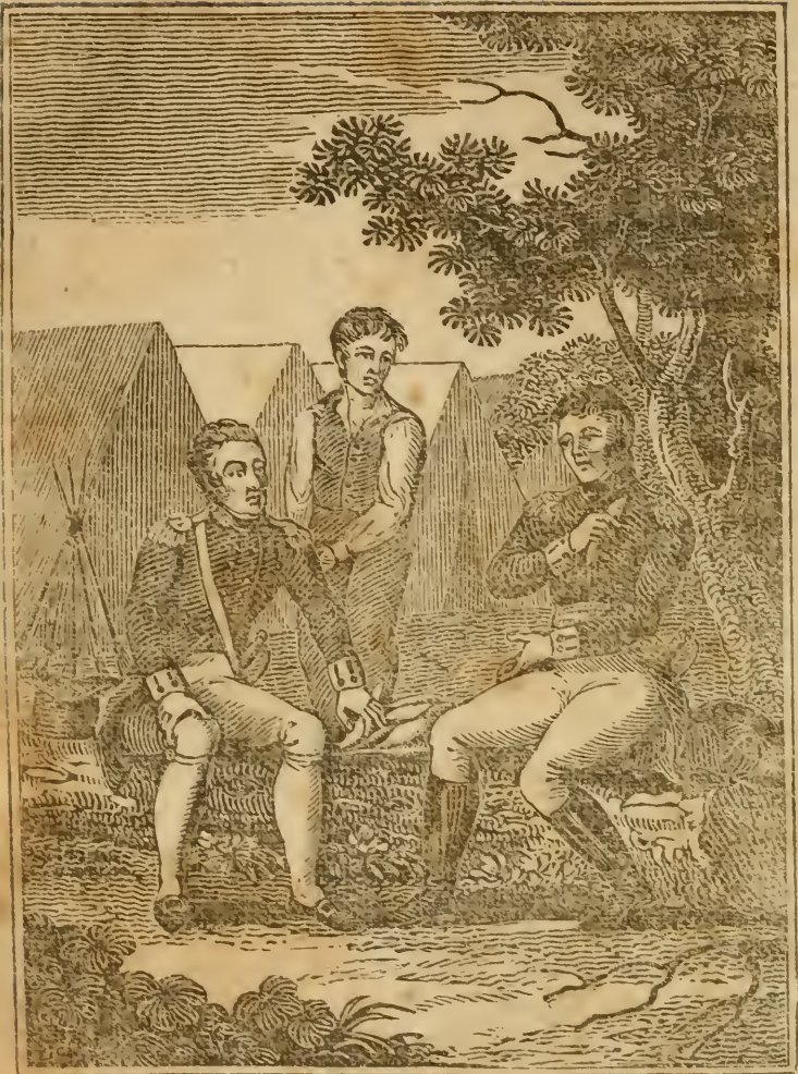
General Marion feasting the British Officer on sweet potatoes.