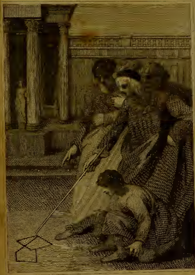
Aristotle & Disciples.