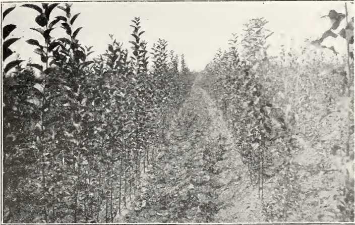
One-Year Budded Apple