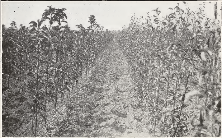
One-Year Kieffer (on left) and Bartlett (on right)