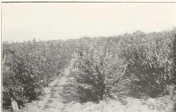
Crepe Myrtle—Two-Year Transplanted and Well Branched