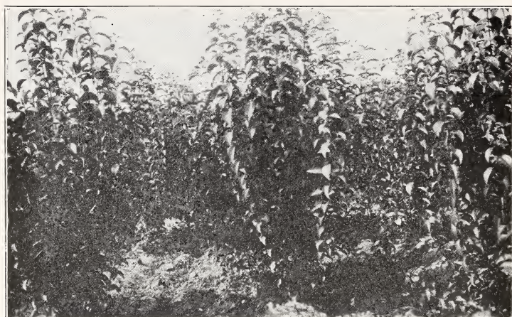
Ligustrum Japonicum—A Large Stock of Plants Like These