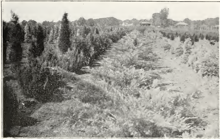
Looking down a row of Juniperus Pfitzeriana