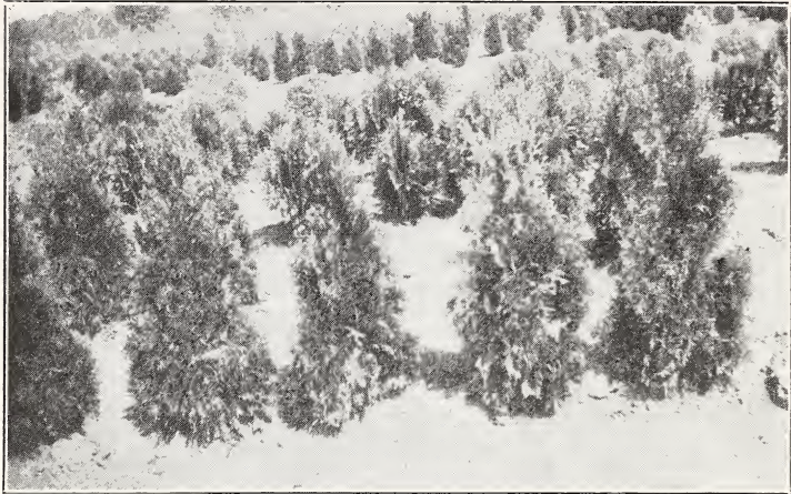
Thuja Occidentalis Pyramidalis