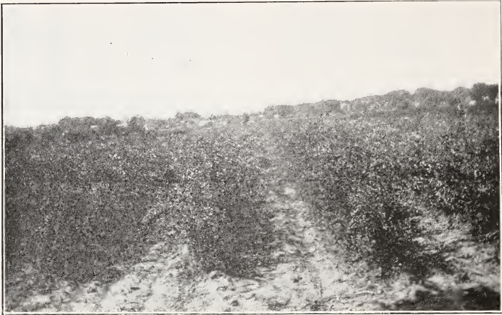
Spirea Van Houttei —Large, Bushy Plants