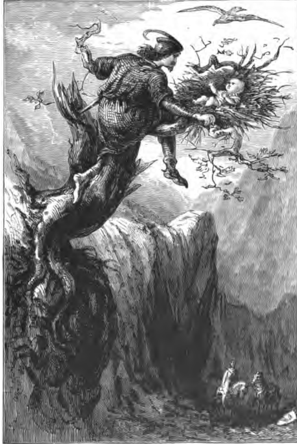
“On Caer-Eryri's highest found the King, A naked babe.”