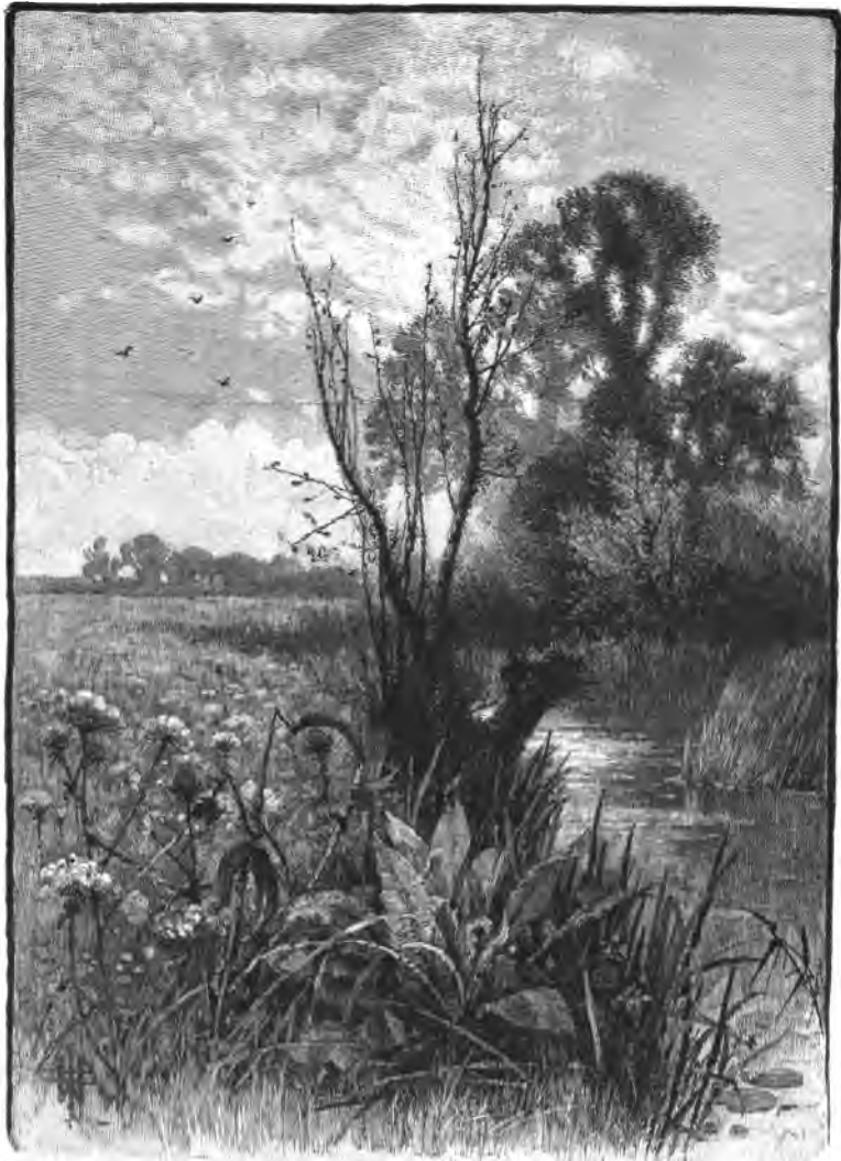
"BUT ANY MAN THAT WALKS THE MEAD."