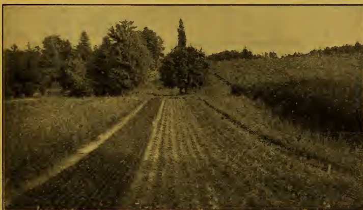
A Portion of the Propagating Grounds at Andorra.