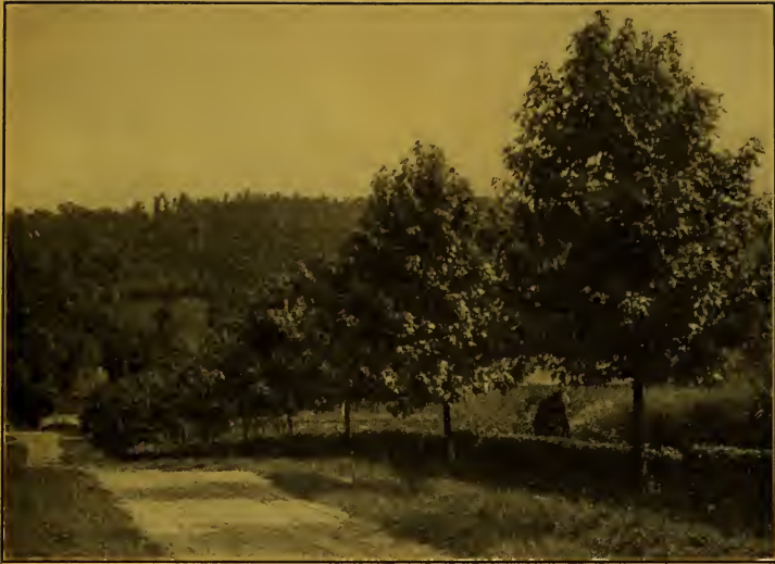
An Avenue of Sweet Gums (Liquidambar), at Andorra.