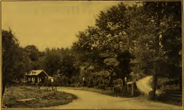
Nursery Entrance and Office.