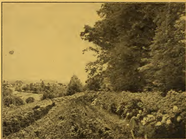
Rhododendrons at Andorra.