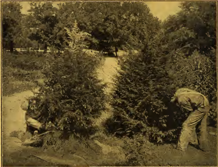
Showing Fibrous Roots of Hemlock.