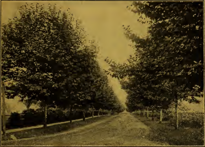
An Avenue of "Andorra-grown" Oriental Planes. (See page 30).