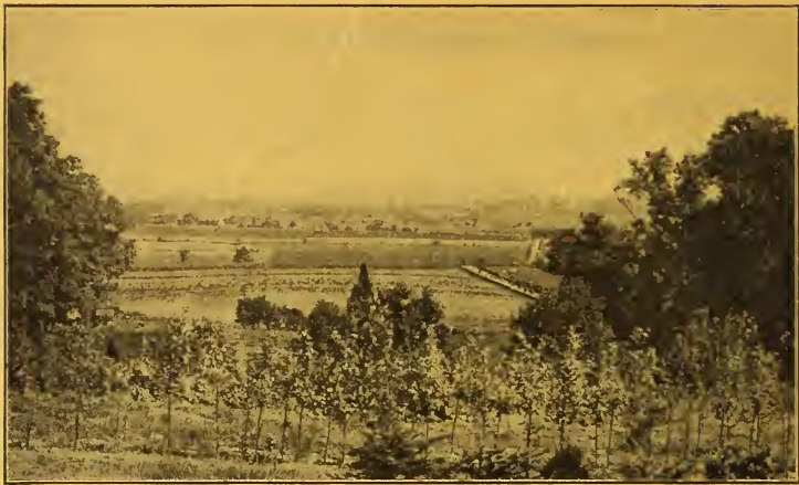
Partial View of Nursery Grounds from Top of Main Nursery.