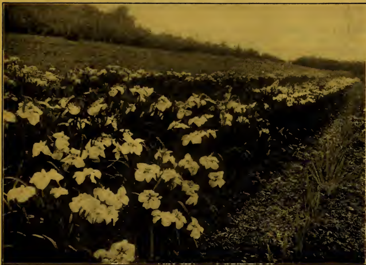
A field of Japanese Iris at Andorra