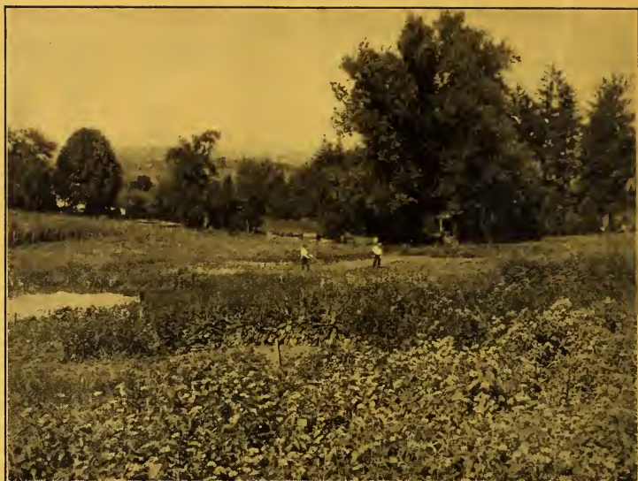
Partial view of Herbaceous Plantations