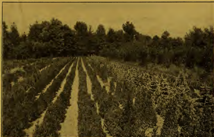
A Block of Box Bush and Evergreens.