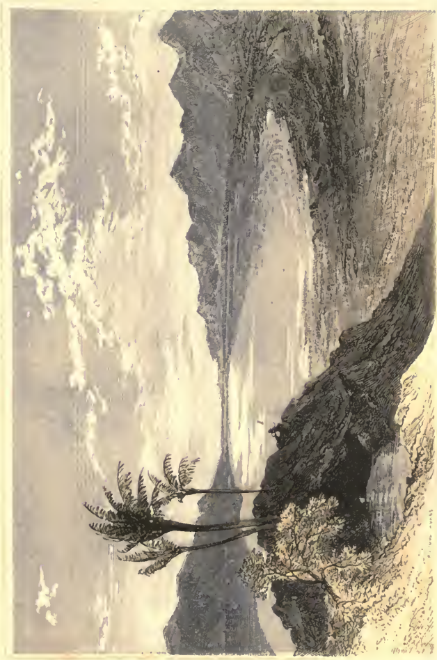
THE DEAD SEA.