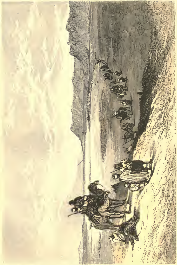
ISTHMUS OF SUEZ.