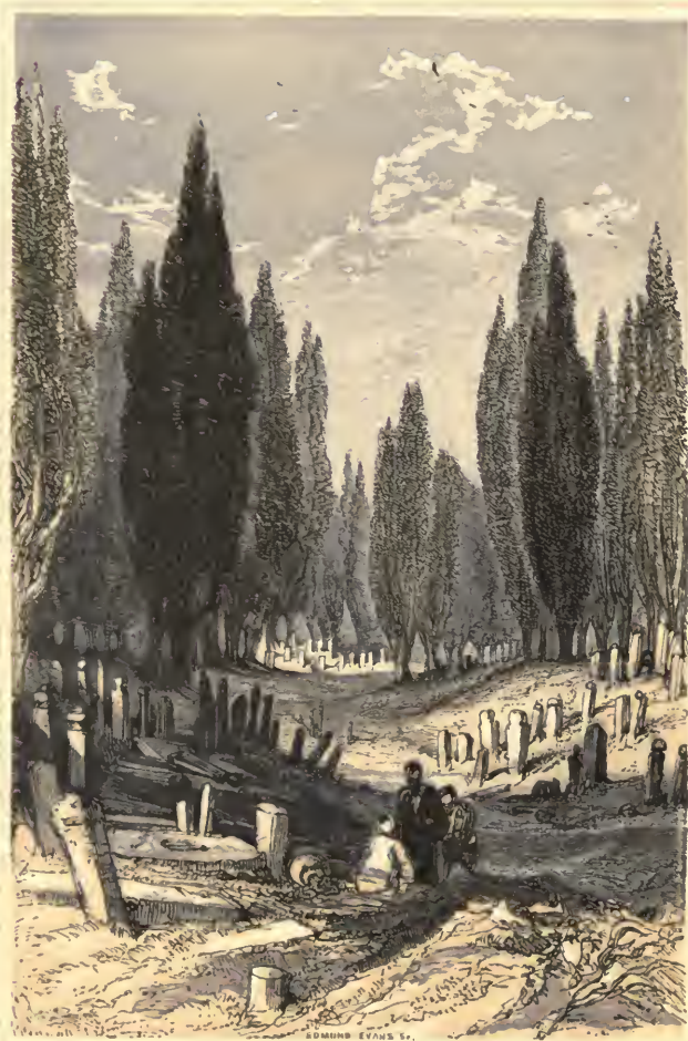
BURIAL PLACE AT SCUTARI.