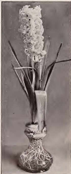
HYACINTH IN GLASS

In amber, amethyst, blue and green. Tall and low glasses. 18 cts. each, 50 cts. for 3, $1.75 per doz.