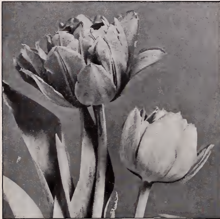
DOUBLE TULIPS COURONNE D'OR