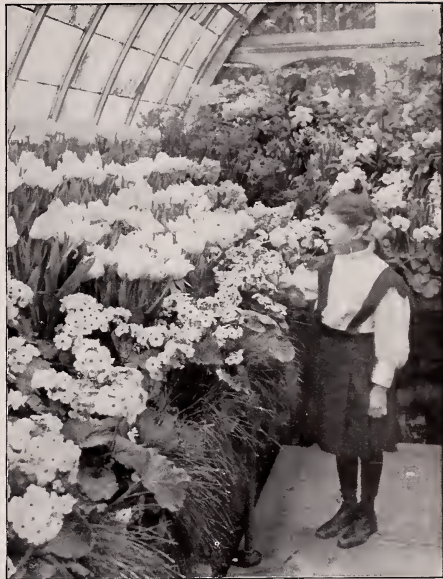
AN EASTER DISPLAY