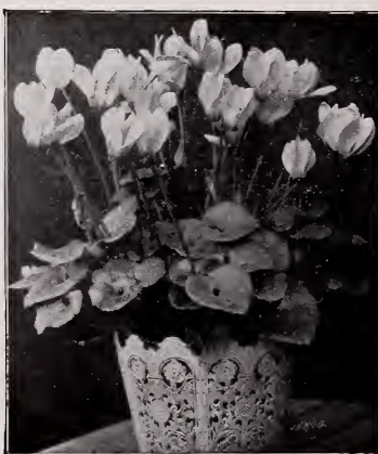
CYCLAMEN PERSICUM GIGANTEUM

Mixed Varieties. 2 cts. each, 15 cts. per doz., $1 per 100.