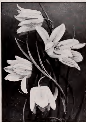
FRITHILLARIA MELEAGRIS (See page 14)