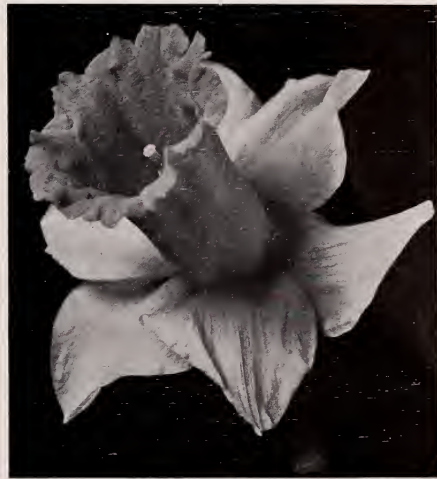
EMPEROR NARCISSUS (see page 8)