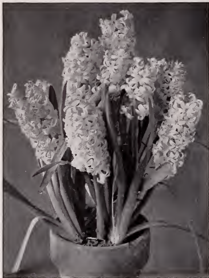
A POT OF SINGLE HYACINTHS

Price, unless given under variety, 12 cts. each, by mail 14 cts.; $1.25 per doz., by mail $1.43; $9.75 per 100