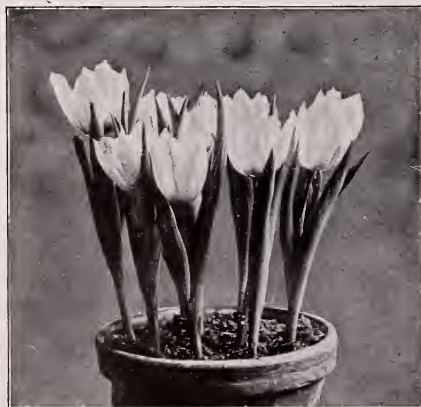
DUC VAN THOL TULIPS

For house culture plant four to six bulbs in a 6-inch pot, and in proportion for the larger sizes of bulb-pans, treat as advised for hyacinths. Good roots and plenty of them, before bringing plants to light and warmth, are essential to success; these roots are produced only in dark, cool and moist locations, and any extra care used in supplying these conditions will be repaid in the more gratifying results obtained. These rules apply to most of the bulbs for house blooming grown in soil, moss or water.