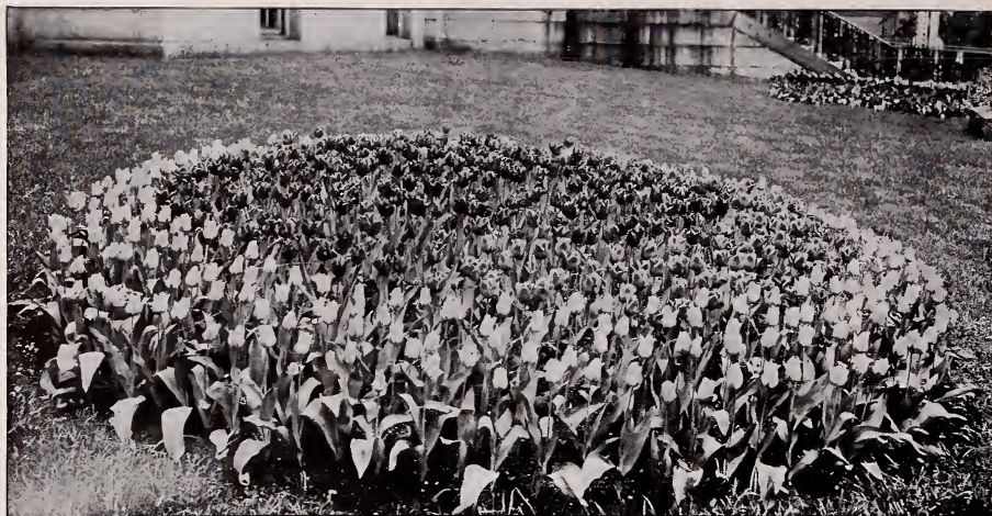
SINGLE EARLY TULIPS