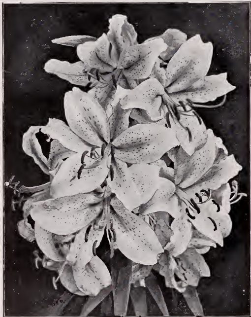
LILIUM SPECIOSUM ALBUM

• Tigrinum flora plenum . Double orange flowers, spotted black. 8 cts. each, 75 cts. per doz., $5 per 100.