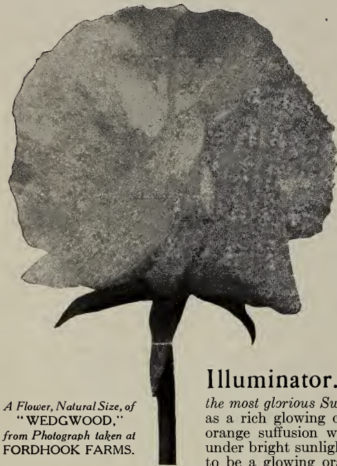
A Flower, Natural Size, of "WEDGWOOD," from Photograph taken at FORDHOOK FARMS.

In sealed packets containing forty seeds each: Per pkt. 25 cts.; $2.00 per dozen pkts.; $13.75 per 100 pkts. In lots of 500 packets or more, $12.50 per 100 pkts. (Cable word, WEDGWOOD.)