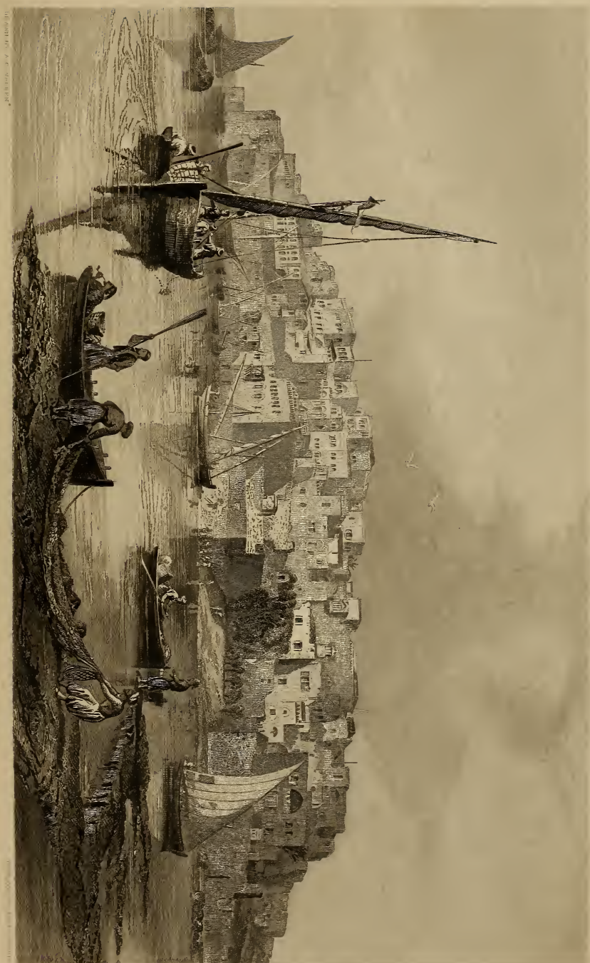
View of the Harbor of Alexandria

© 1877 by the American Book Company, New York