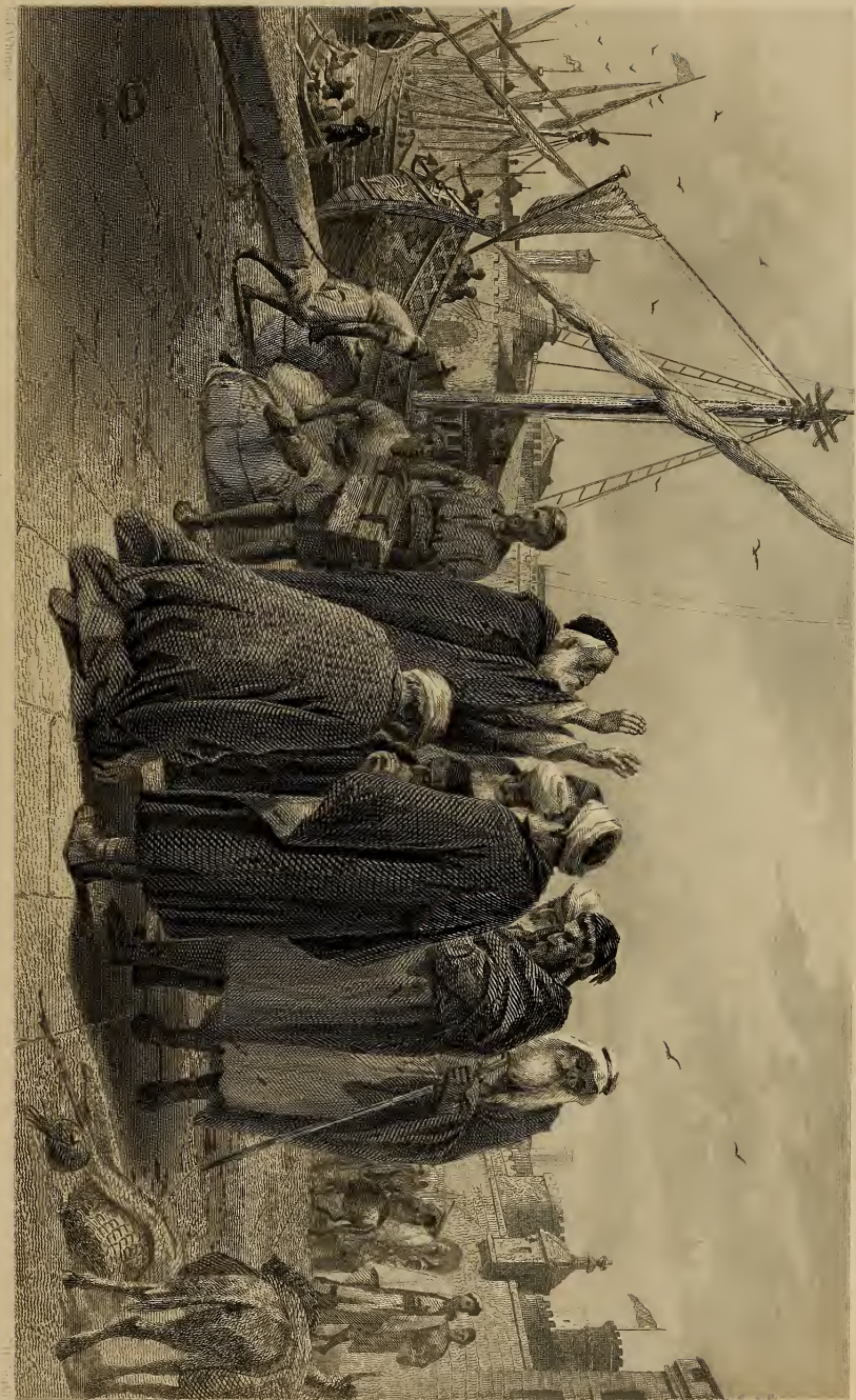
PAUL'S FAREWELL, AND MULETTS.

London and Edinburgh, 1841. No. 10. The "Illustration."