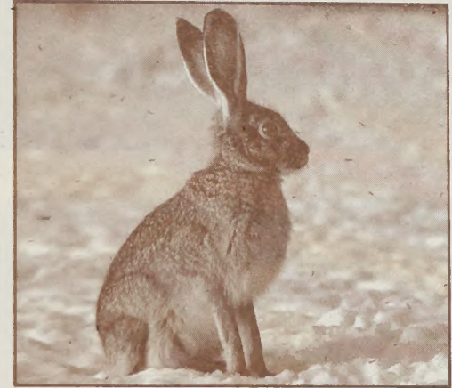
Black-tailed jackrabbit

Large-scale fragmentation of shrub-steppe habitats, heavy grazing use, coyote numbers, and sport-hunting jackrabbits are all factors that reduce jackrabbit numbers and availability as a potential prey source for Canada lynx.