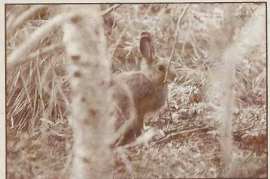
Snowshoe hare

The interviews, however, suggest a greater use of prey other than snowshoe hares than has been documented in boreal forests of Canada and Alaska. There is also evidence to suggest a reliance on prey species that either have not been documented or are rarely detected by research. The more varied prey base reported by interviewed individuals may be the result of the proximal location of atypical Canada lynx habitats that periodically support alternate Canada lynx prey adjacent to snowshoe hare habitats. Alternate prey mentioned most often in the interviews include white-tailed jackrabbit, black-tailed jackrabbit, porcupine, and beaver. One person also suggested pikas as potential prey.