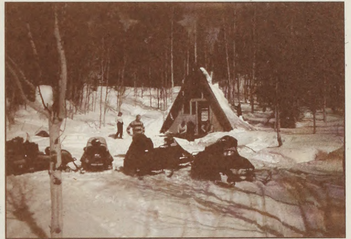
Winter recreation continues to increase in areas once occupied by Canada lynx.

When asked whether there were more roads now than when he occasionally saw or trapped Canada lynx, one southeastern Idaho trapper replied that the number of roads is only slightly greater than in the 1950s and 1960s, but at that time nobody used roads in the winter when Canada lynx were present. He accessed his trap lines with cross country skis or snowshoes. He said now the area receives intensive snowmobile and ATV use. He believes that this is a primary factor in the absence of Canada lynx since the early 1970s. Two interviewees who spent a great deal of time in the Sawtooth Valley echoed the same sentiments. Canada lynx were relatively common before the widespread and increased use of snowmobiles, cross-country skiing and ATVs. The threat to Canada lynx from motorized and nonmotorized recreational activities has not been researched.