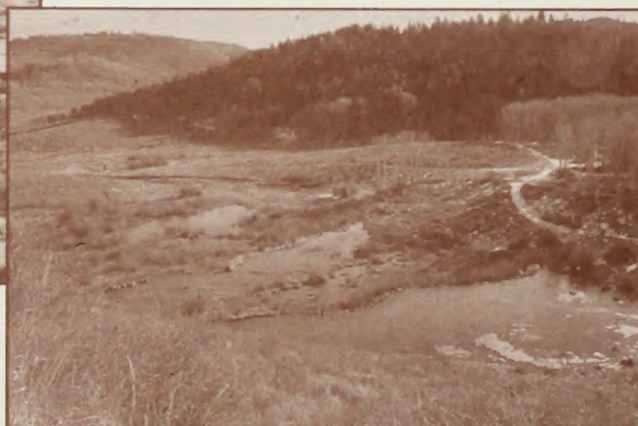
This beaver pond complex is the area used for hunting by a group of Canada lynx in the late 1960s or early 1970s near Soda Springs. There is now a snowmobile yurt constructed adjacent to the ponds.