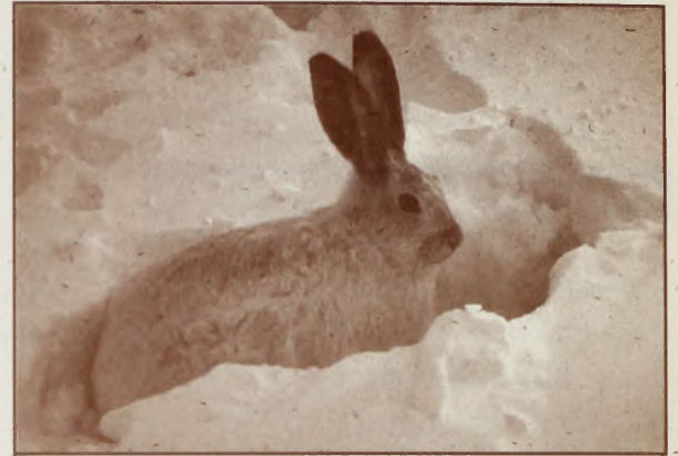
White-tailed jackrabbit

Countless variations of Canada lynx behavior could occur as the result of the utilization of jackrabbits by Canada lynx. All may be true at one time or other, depending on prey density, prey location and behavioral differences among individual Canada lynx. Five possible scenarios, that are based, in part, on anecdotal information obtained in the interviews, are described below.