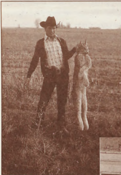
This Canada lynx was shot near Jerome, ID in 1972 during a jackrabbit population peak.