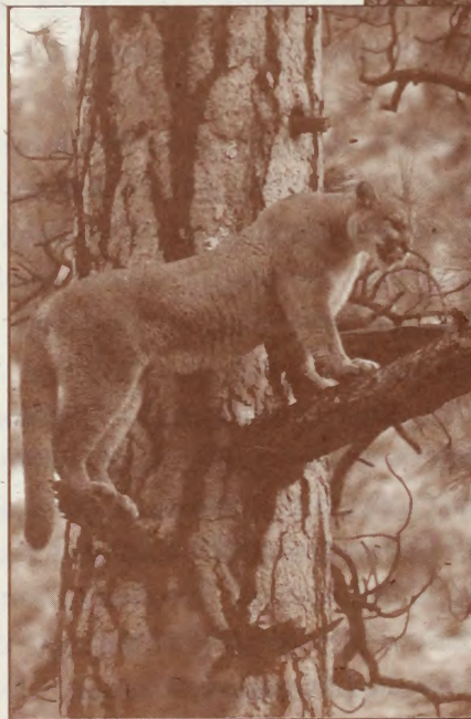
Mountain lions are both a predator and competitor of Canada lynx. Their numbers may be at all-time highs.

Research and anecdotal information both document mountain lions killing Canada lynx. The current high numbers of mountain lions may also be having a significant effect on Canada lynx either by competing for, or in the case of porcupines, possibly eliminating an important and limited prey resource. Current population densities of mountain lions increase random opportunities for killing Canada lynx. A 1908 newspaper article in the Salmon Recorder-Herald tells of indiscriminate removal of Canada lynx, bobcats, wolves, and coyotes, yet no mention is made of mountain lions.