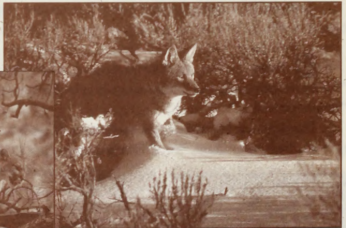
Coyotes may be both a competitor and predator of Canada lynx.