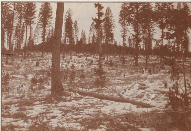
Timber harvest practices on dry sites can result in a loss of snowshoe hare habitats for long periods of time.

Timber harvest was mentioned by several observers as a factor in the decline in the Canada lynx. Timber management practices appear to have variable impacts on Canada lynx and Canada lynx prey, depending upon the methods or techniques used and geographic region. Although clearcutting has been shown to have beneficial effects for Canada lynx in some habitats, benefits are dependant on successful forest regeneration. On rocky, dry sites, clearcutting and other silvicultural practices often mean regeneration with a low stem-density, and in extreme cases, it is virtually nonexistent. Where regeneration does provide the high stem-densities optimal for snowshoe hares, it has generally been shown that the smaller the logging units or thinned stands, the better for Canada lynx and their prey. These units or stands should be interspersed between unaltered mature stands that offer Canada lynx denning habitat and movement corridors. Stem densities less than what has been shown as beneficial for snowshoe hare and Canada lynx normally occur on sites that are manually planted or on sites that are thinned regardless of regeneration method.