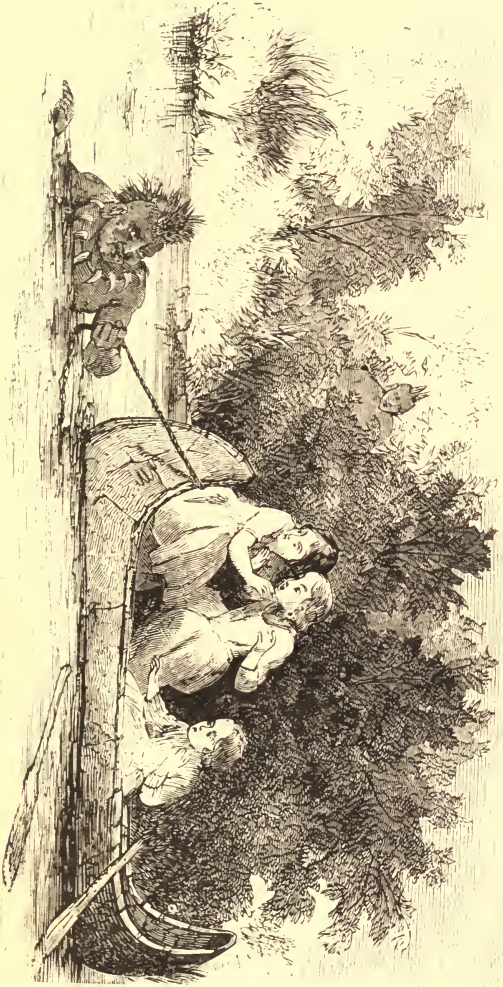
CAPTURE OF BOONE'S DAUGHTER