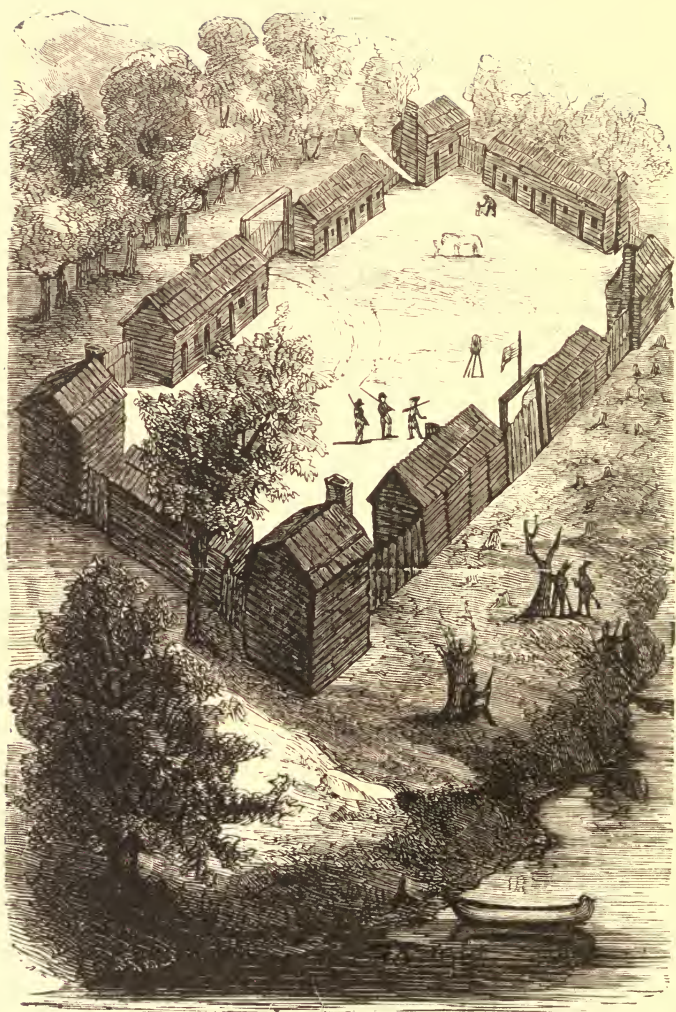
THE OLD FORT AT BOONESBOROUGH