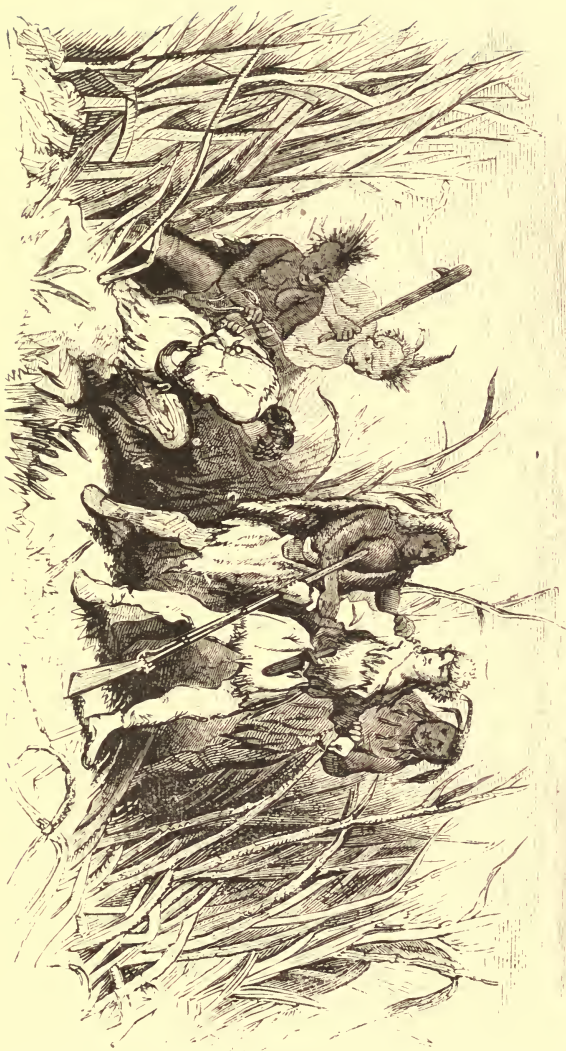
CAPTURE OF MOONE AND STUART.