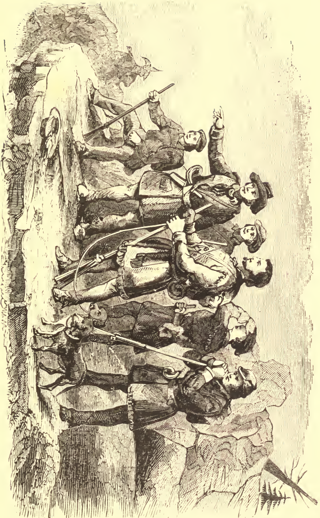
BOONE'S FIRST VIEW OF KENTUCKY.