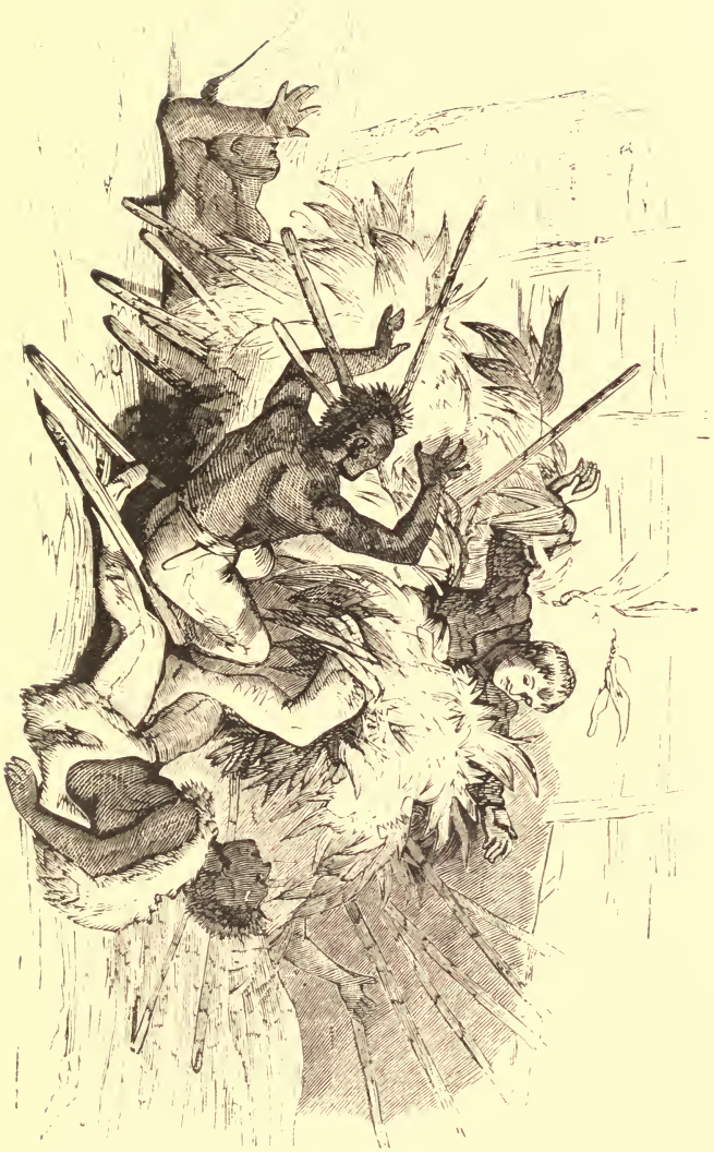
BOLD STRAGGLES OF MOON