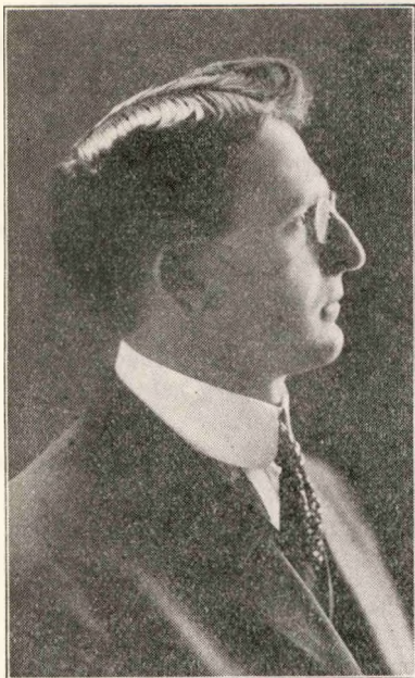
G. A. COBB

Democrat, Candidate for Nomination for Governor