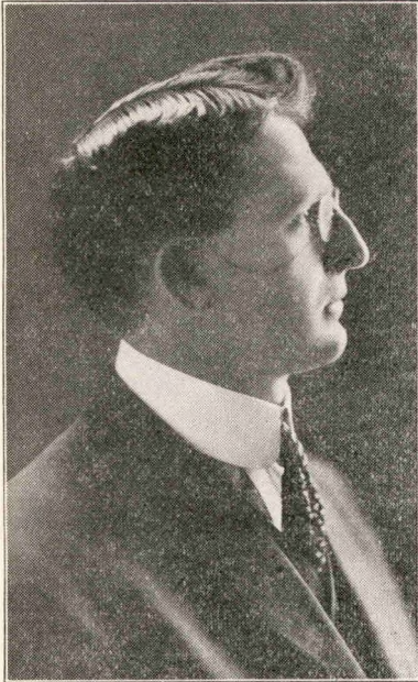
G. A. COBB

Democrat, Candidate for Nomination for Governor