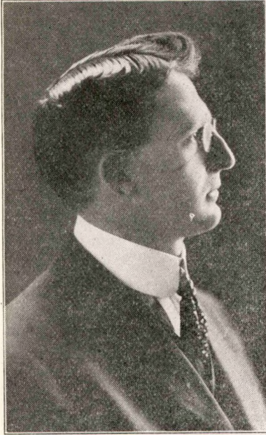
G. A. COBB

Democrat, Candidate for Nomination for Governor