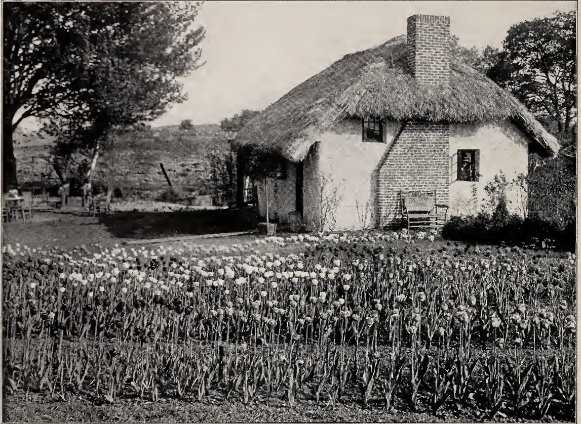
Darwin Tulips in the Dutch Garden, Bloemgaard, at our Nurseries in Lexington

This year we made a special importation of Holland Bulbs which will be displayed in bloom in our Trial Grounds at our Nurseries in Lexington for the benefit of our discriminating patrons in order that they may view and select the varieties they desire for planting in the Autumn. Notice will be sent in May.