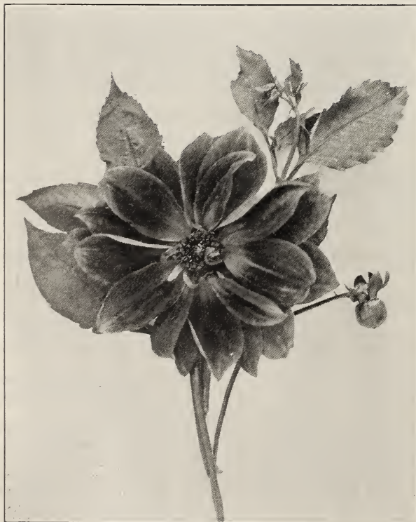
Scarlet Century — Single