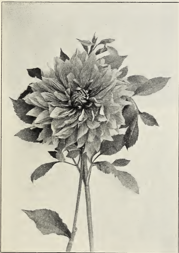
George Walters — Cactus

Not less than six of one variety at the ten rate