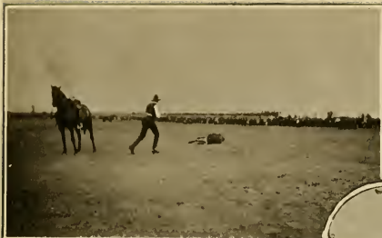
PONY HOLDING DOWN STEER.