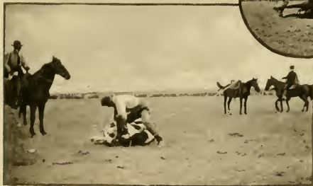
TIEING A MEAN ONE.