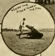
WHERE THE STEER THREW THE MAN