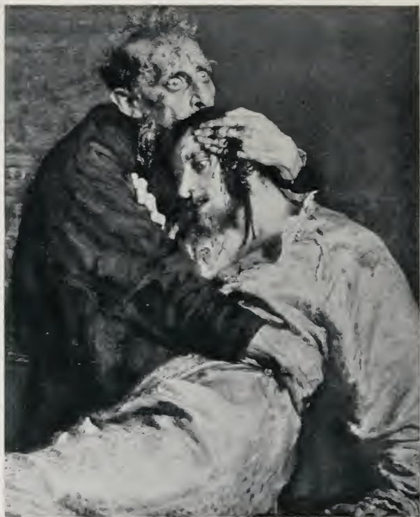
IVAN THE TERRIBLE AND HIS SON