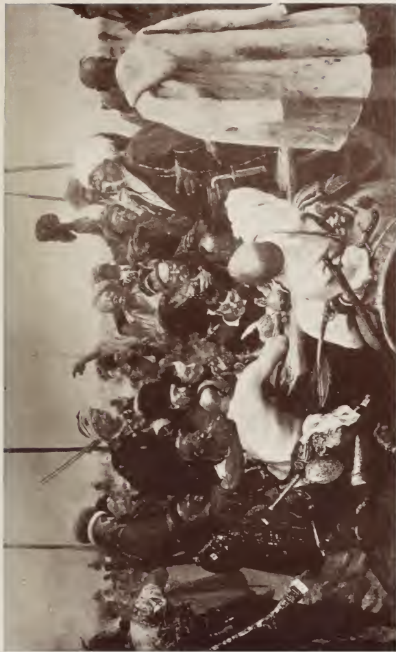
THE COSSACKS' JEERING REPLY TO THE SULTAN