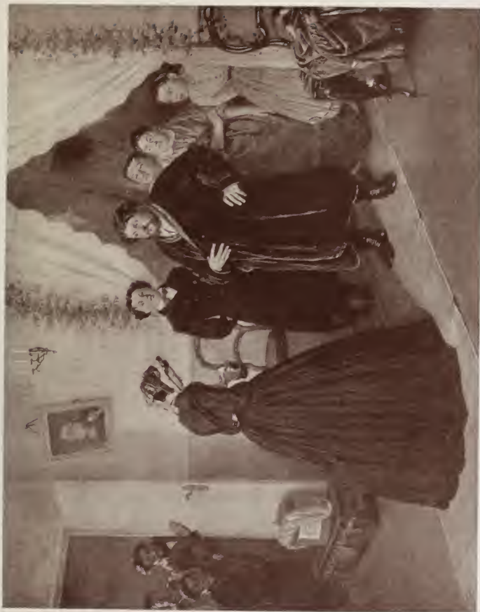
THE ARRIVAL OF THE GOVERNESS.