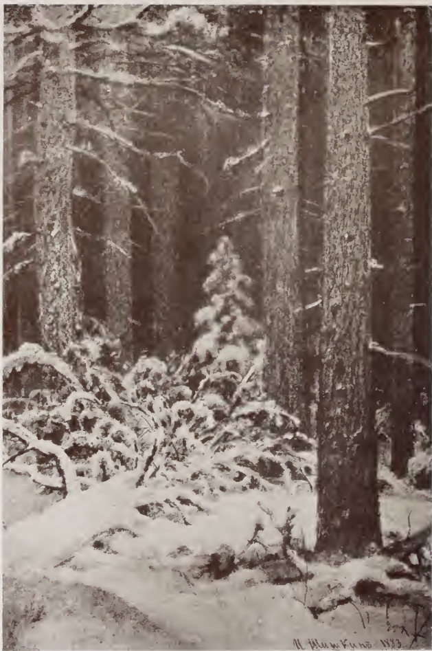
THE FOREST IN WINTER