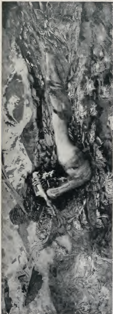
THE DAEMON (FINAL VERSION, 1902)