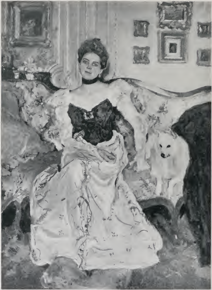
PORTRAIT OF PRINCESS YUSUPOV