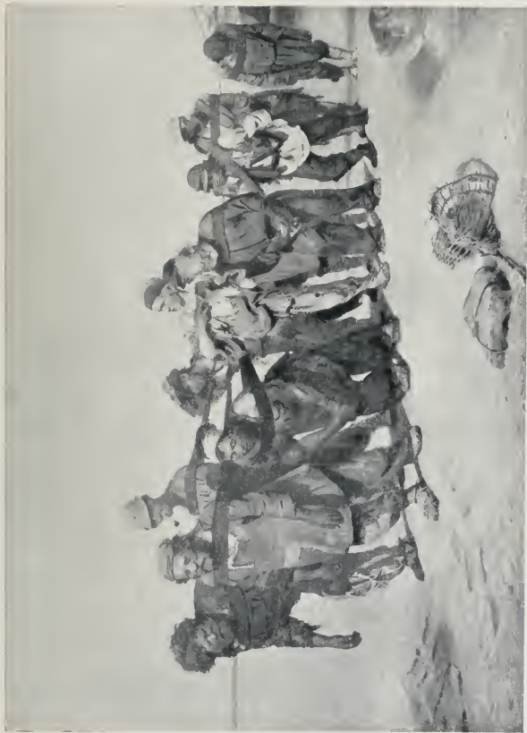
THE BARGEMEN OF THE VOLGA