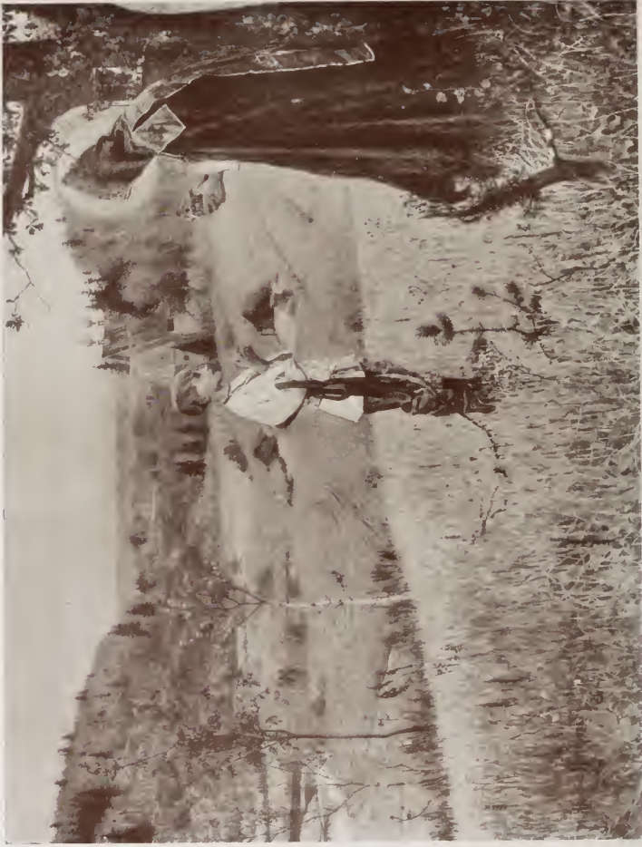
THE VISION OF ST. BARTHOLOMEW