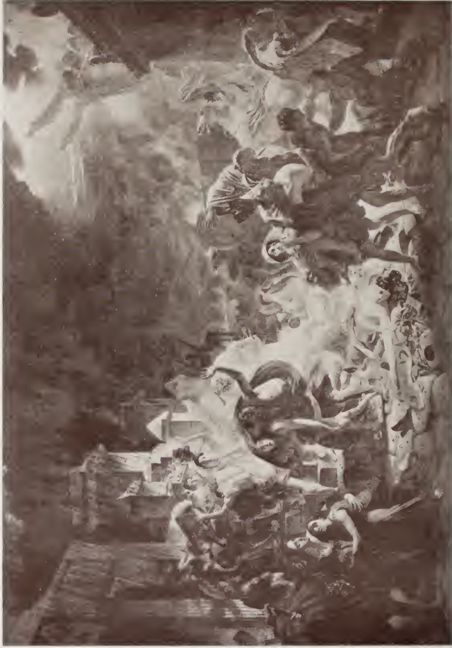
THE LAST DAYS OF POMPEII