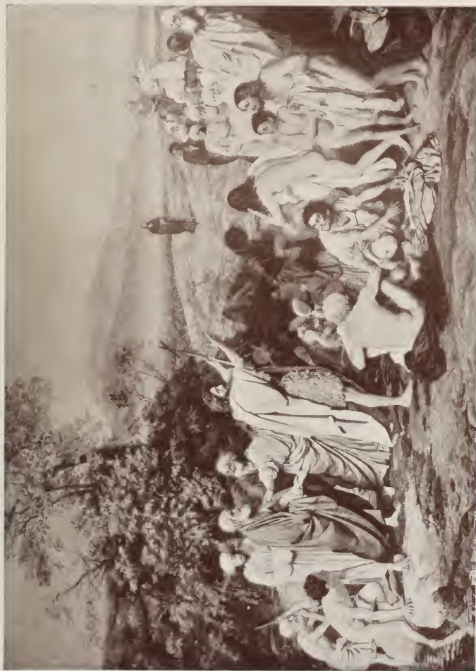
JOHN THE BAPTIST PREACHING IN THE DESERT