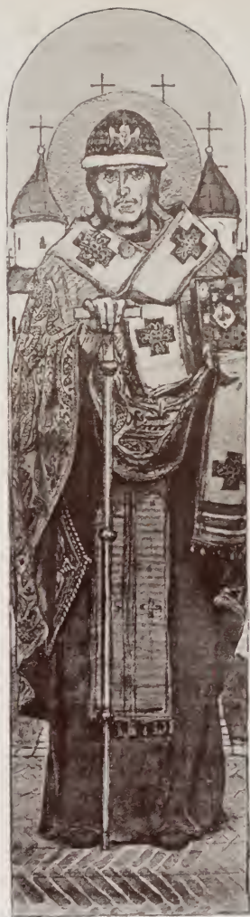
ST. NIKITA OF NOVGOROD Victor Vasnetsov