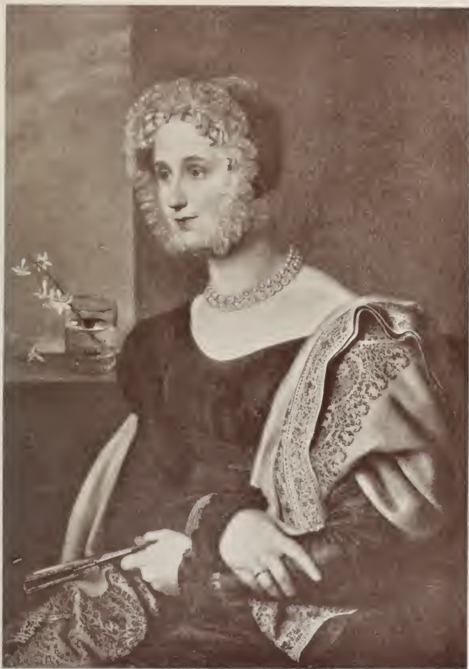
PORTRAIT OF A LADY