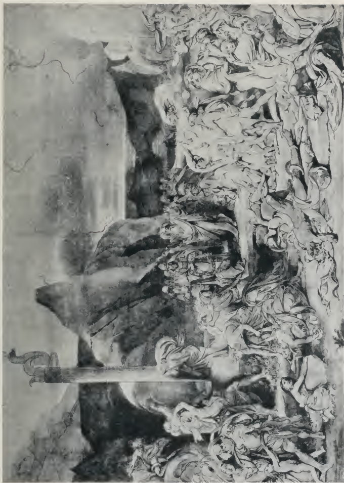
THE BRAZEN SERPENT