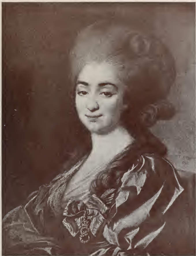
PORTRAIT OF PRINCESS GOLYTZIN