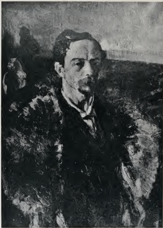
PORTRAIT OF THE ARTIST