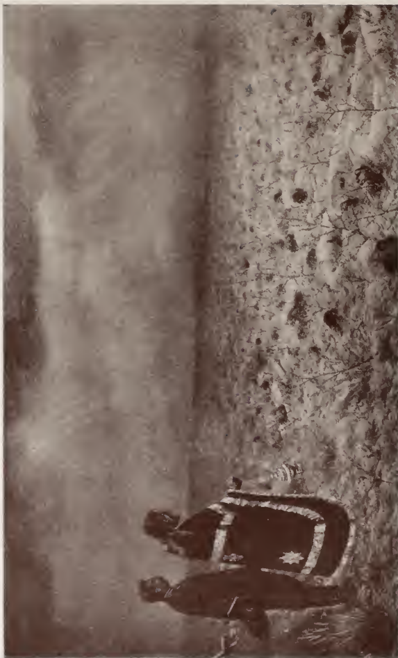
THE MASS AT THE BATTLEFIELD