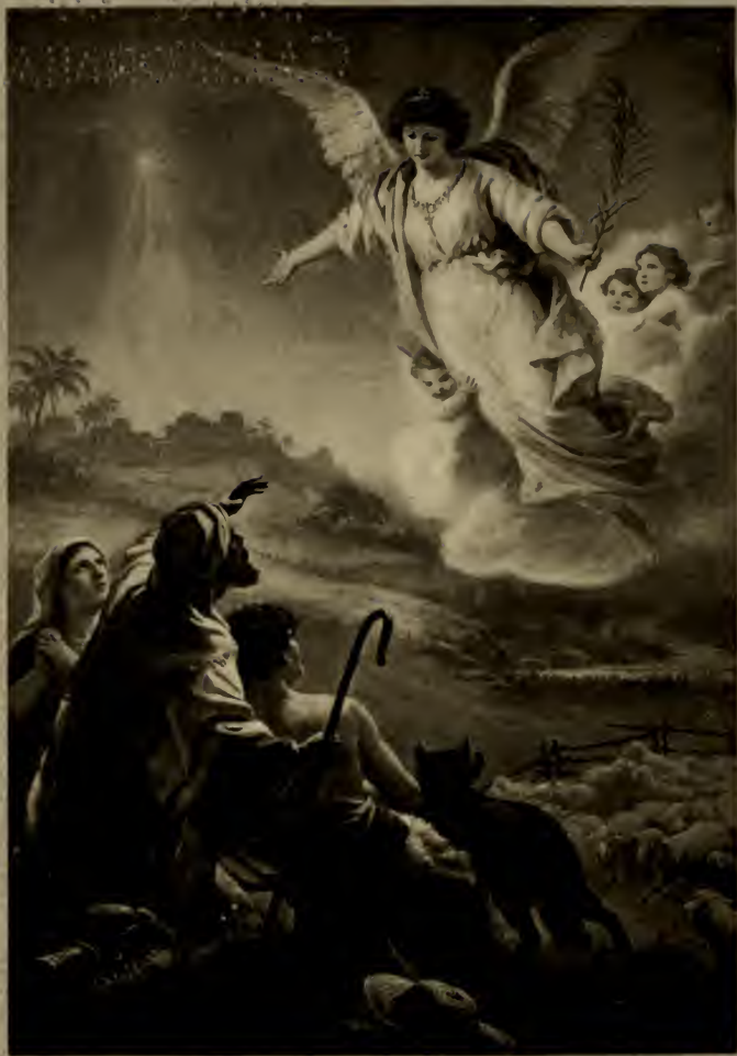
APPARITION TO THE SHEPHERDS