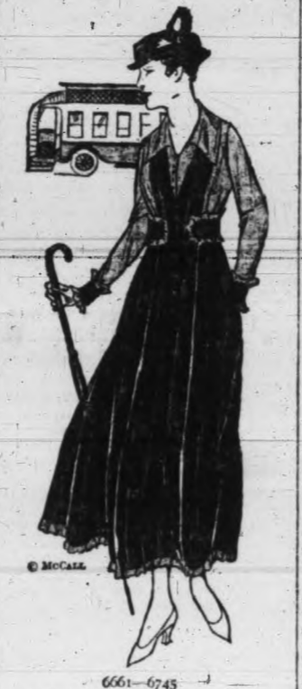
A Frock of Taffeta and Crepe Georgette

The Popularity of "Sport Clothes." Time was, not very long ago, when "sport clothes" were left, without a moment of hesitation, to the wardrobes of the leisure class, who had time for sports; nowadays, we find "sport clothes" or in other words, comfortable, sensible clothes, in every wardrobe.