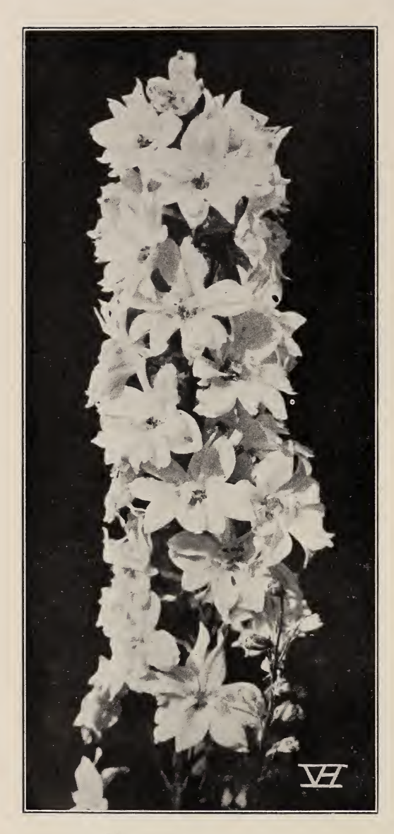
An "EMILY TAYLOR" Seedling The "All-Out-Together" VH type in tinted ivory, with hint of blue.