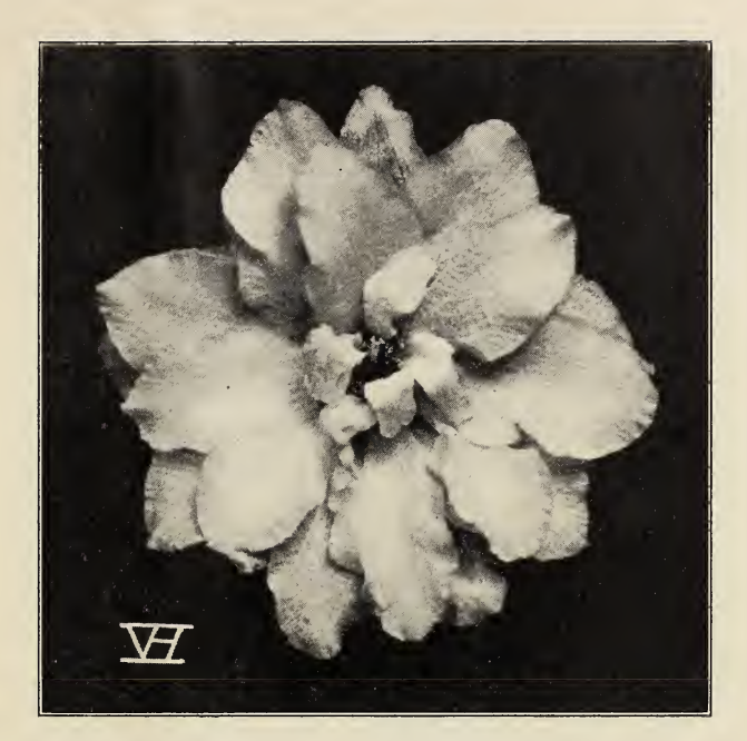
A PERFECTED VANDERBILT (Soft pink shaded light blue.)