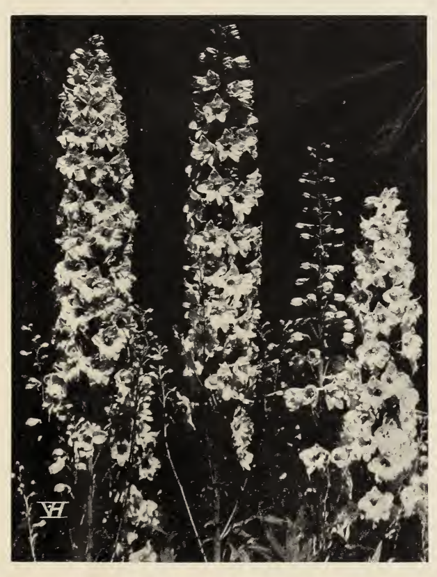
More VH TYPE PLANTS, 2nd Year. Double, Ruffled, Bee'd, Pink-blue Pastels.

To the VH Circle:—Greetings once more to the great family of Delphinium Lovers growing and praising our productions. In our Message we voiced appreciation of the flower lover to flower lover note of our strain. But the greater number of new Vanderbilt fanciers have now come from these same folks as members of Garden Associations, and Garden Sections of the Federated Woman's Clubs doing so much for "Better Gardens" in America. More than ever, we emphasize our first and much disputed claim that Delphinium is a typlical "Ladies Flower" and its popularity would arise largely through their definite preferences therein.