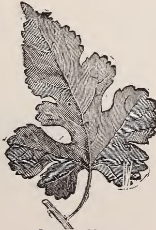
LEAF OF MULBERRY.

Poplar, Golden ( Van Geertii ). The bright sunlight of its foliage is useful in lighting a landscape. 7 to 8 feet, 75 cents.