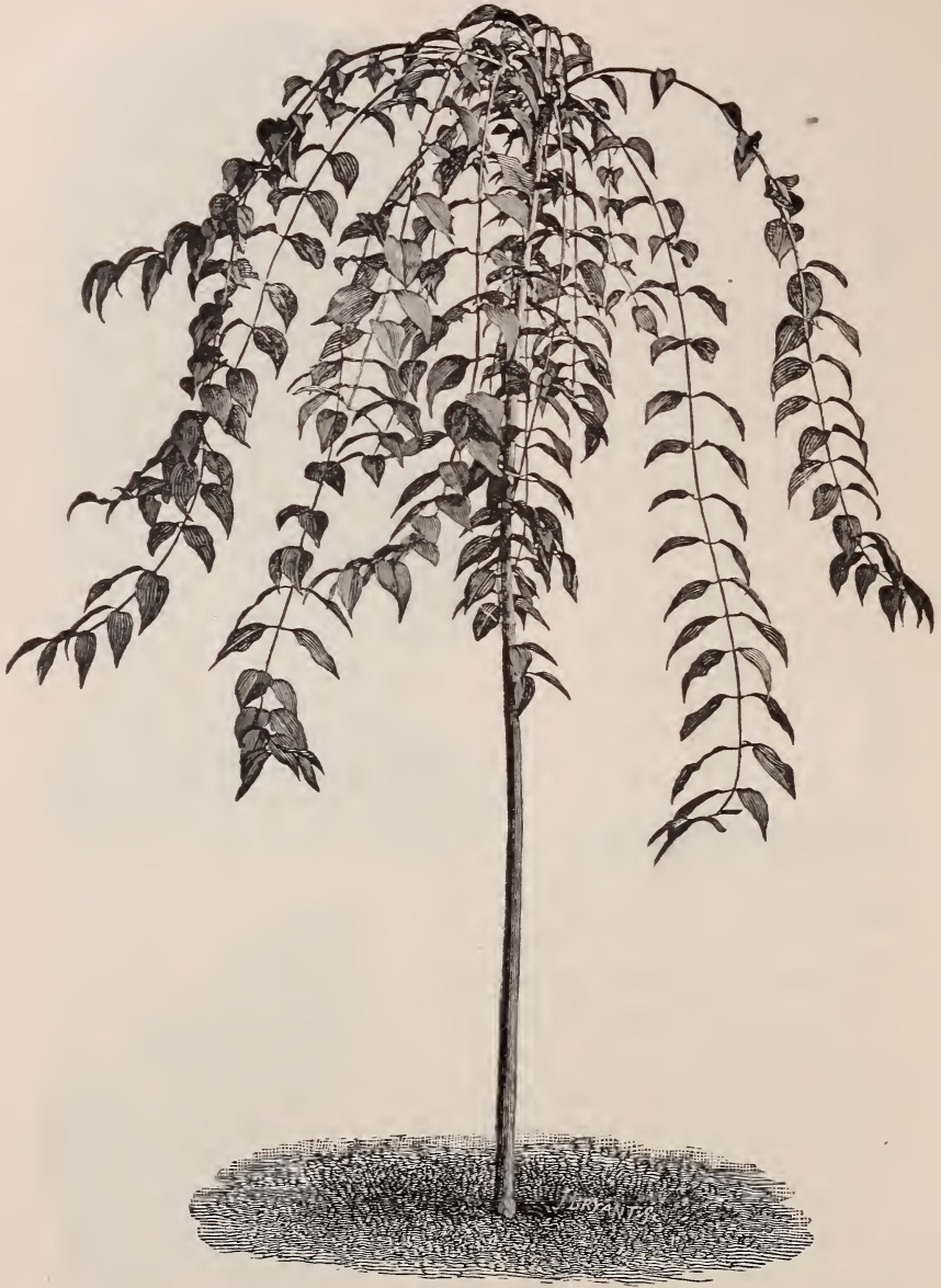
CHINESE WEEPING LILAC.