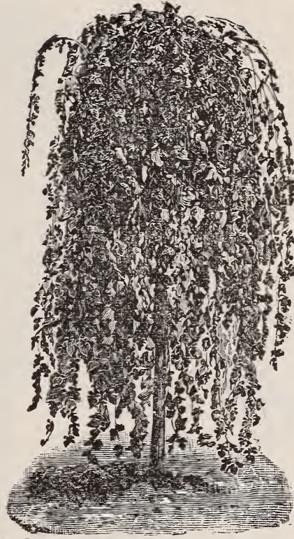
ONE YEAR'S GROWTH.—TEAS' MULBERRY.—TWO YEARS' GROWTH.

Oak, Scarlet. For ornamental use, this is the best of the species; the glossy, green leaves and the autumn coloring being quite marked. 75 cents.