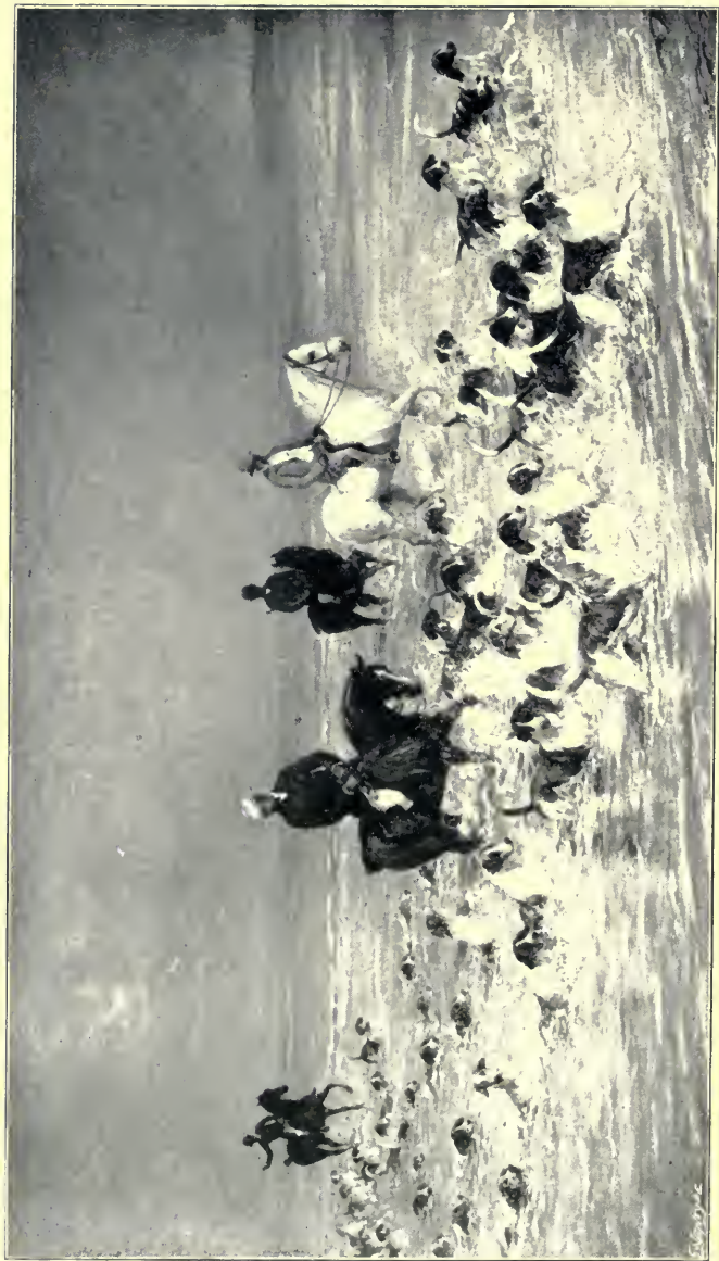
THE CLEVELAND FOXHOUNDS AT EXERCISE.