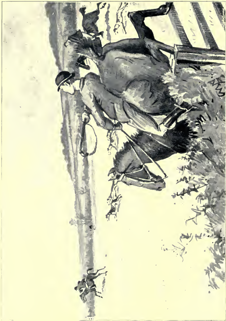
DRAG HUNTING, CAMBRIDGE UNIVERSITY, 1879