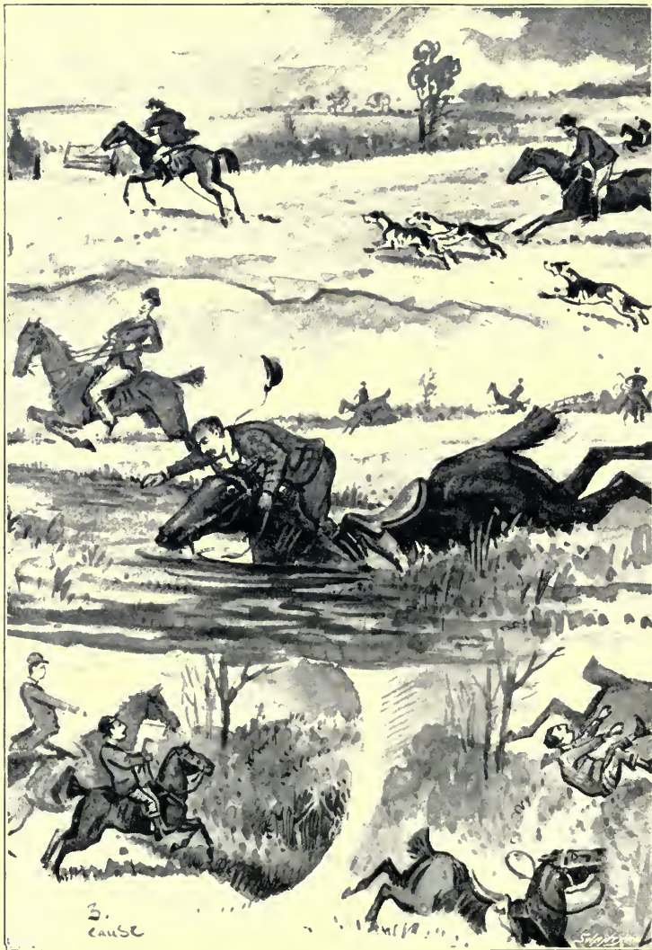
INCIDENTS WITH THE CAMBRIDGE UNIVERSITY DRAG.