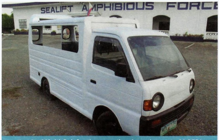
1 unit of Multi-Cab for the operational requirement of LC551

Administrative and logistical requirements of SAF floating assets were strictly monitored. SAF was able to approved 27 different logistical requirements of its floating assets to ensure its readiness prior every mission.