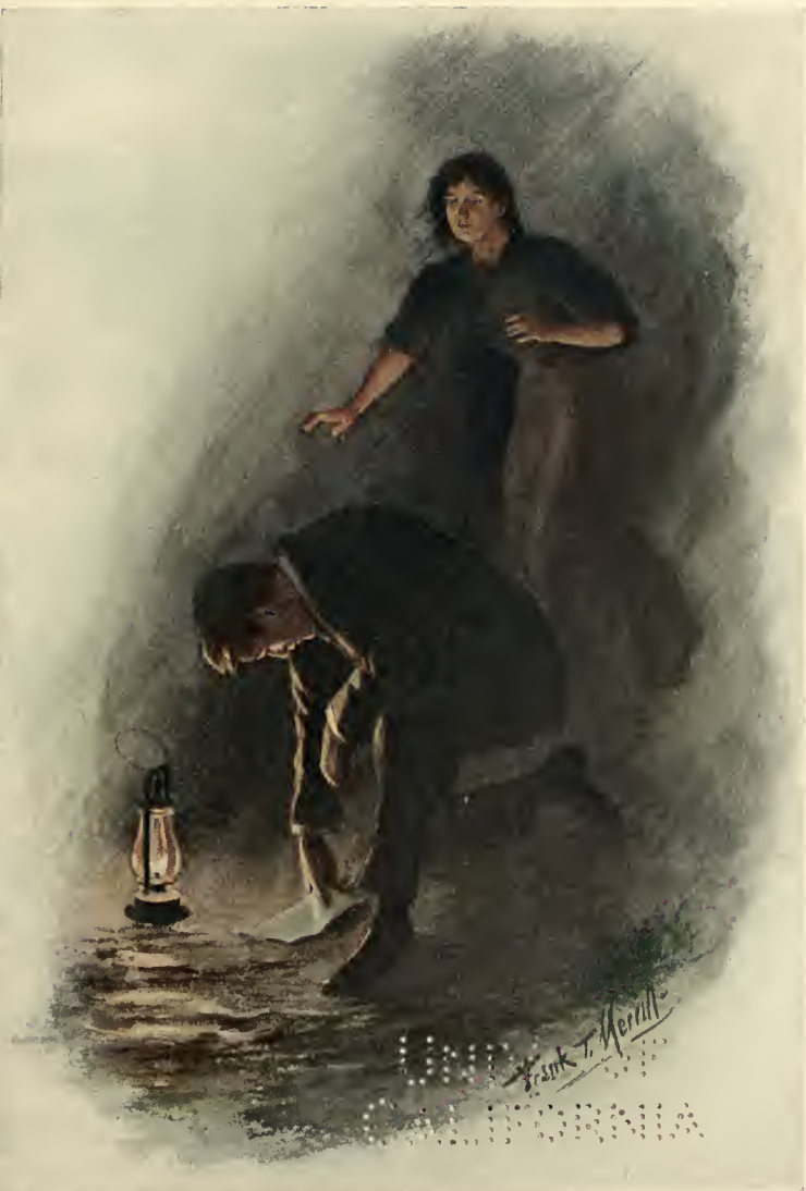
A slight, dark form stole from the shadows and laid a hand on the stooping man's shoulder. (Page 122.)