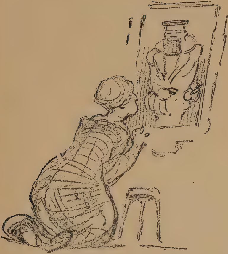
Hilda Maple admits that she is a sinful woman