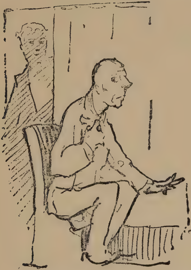
Growing nervousness of Lord de Beurivage