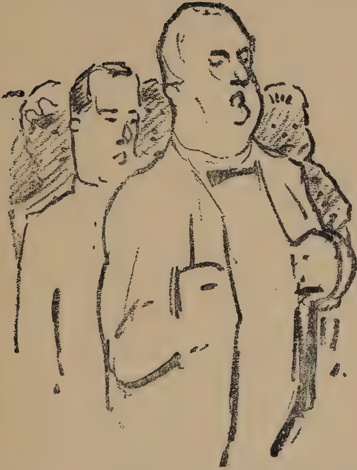
Partial, but representative deputation of the domestic staff of Rackham Catchings protesting against the Headless Thing