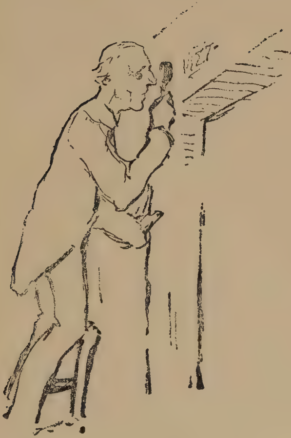
Lord Hambourne is astonished at the modern habits of the fifteenth century