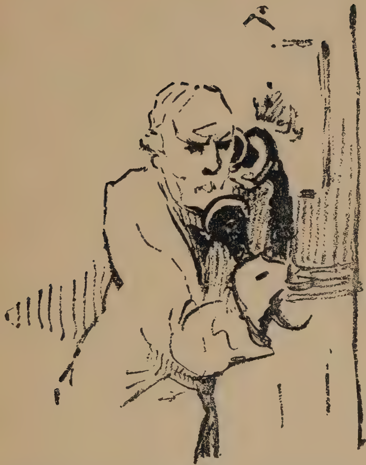
Distraction of Lord Hambourne on being offered the usual terms