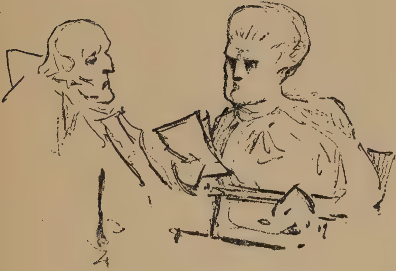
Aunt Hilda settling everything