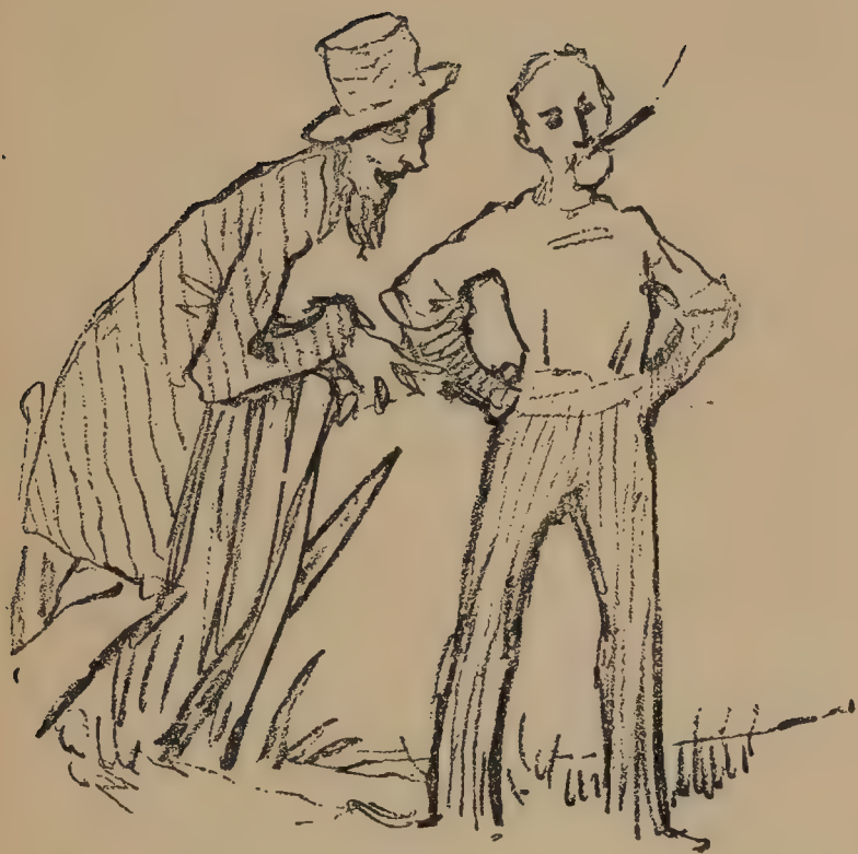
Neighbour Hellup and Neighbour Jake