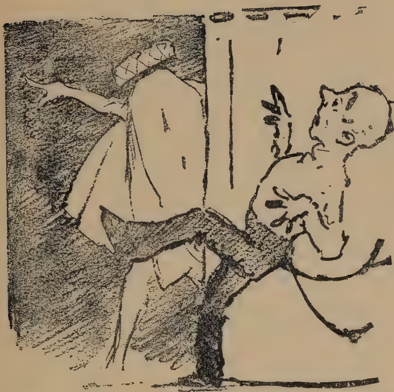
Unaffected emotion of George, First Baron de Beau- rivage on the appearance of an historic figure