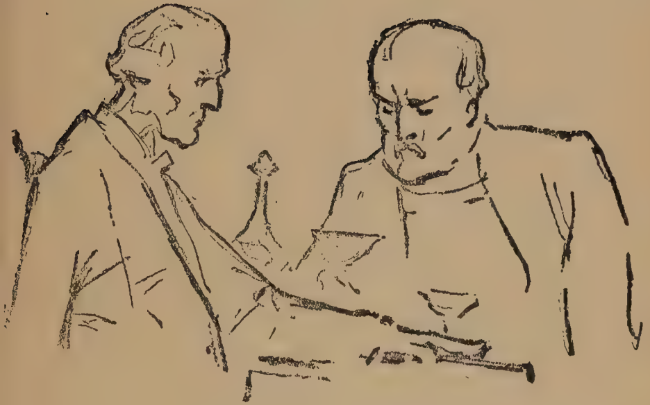
The brothers at Rackham